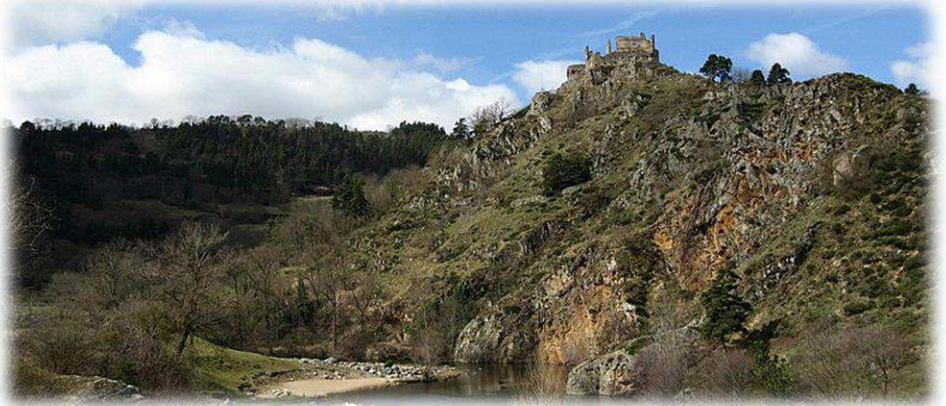
Beaufort castle at Goudet