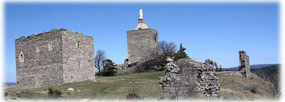
Le Chateau de Luc