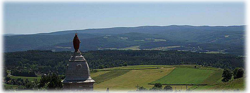
The view from Pradelles