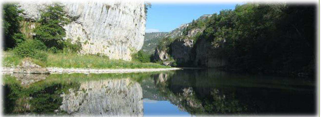
The Gorge bottom

Your first three days follow a common trail, with an option to shorten the first on demand. The middle-section allows for options according to your personal preferences and desired level of challenge: stay low and hug the river or climb high, enjoy the Causses, and return to river-level late afternoon. If you are looking for some extremely flexible and varied walking in France’s most remote region, then the Gorge du Tarn is a must.