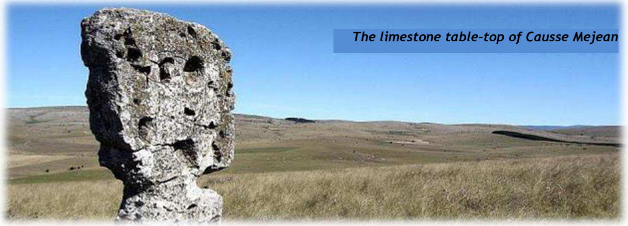
The limestone table-top of Causse Mejean

“Carefully-selected accommodation based on knowing our partners well.”