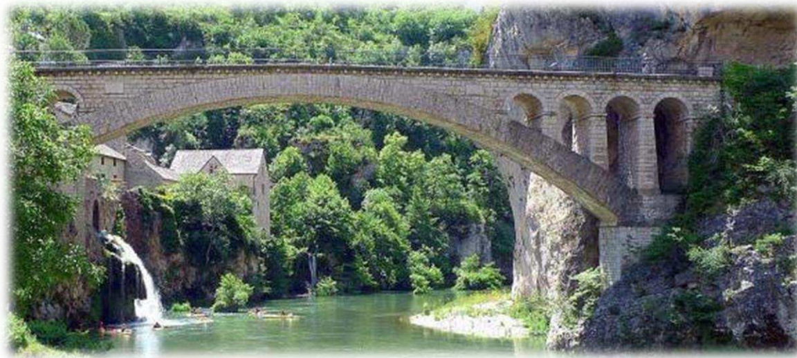
The beach at St Chely