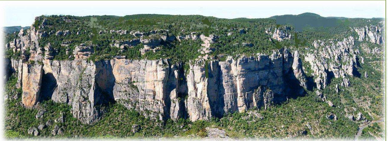
Walk the Jonte Gorge

Tarn Gorge Walking offers the ultimate insight into the region that has become known as ‘Les Gorges du Tarn.’ You walk paths that are as spectacular as the TMBs ‘Balcon du Sud’ minus the snow; you visit early human settlements and deserted troglodyte ruins that will stretch your imagination exponentially; and whilst the flora is critically acclaimed, befitting of the Parc National des Cévennes, the presence of avifauna, principally raptors, is second to none.