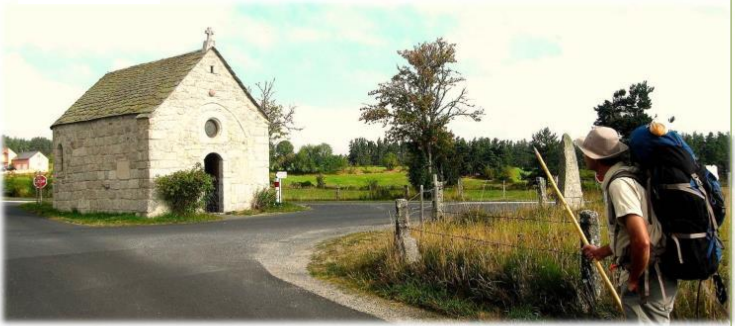
La chapelle de la Bastide

There you have the essential ingredients of our Taste of Camino Francês tour: an opportunity to enjoy the best of what the Way of St James has to offer in two accommodation-led formats to suit your preference. What differentiates this trip from other 'Camino' tours is the emphasis on accommodation excellence. You only get one bite at the cherry, so here's your chance to do it in style. And once bitten, we trust you'll be back for more in the not-too-distant future.