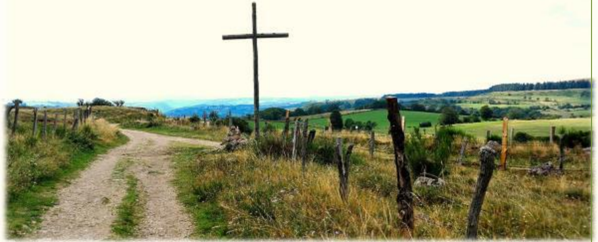
En route to St-Chely