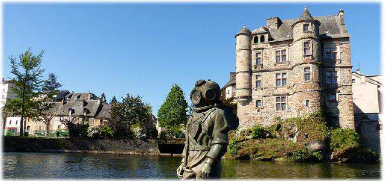
The Lot at Espalion

Le Puy-en-Velay is better for those wishing to travel onto Lyon.