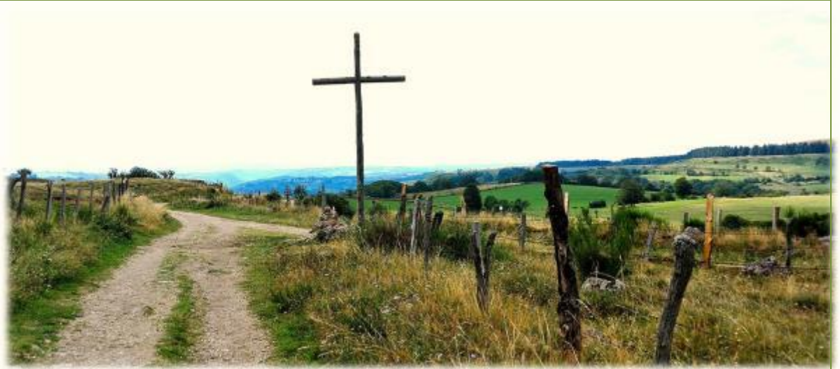
En route to St-Chely