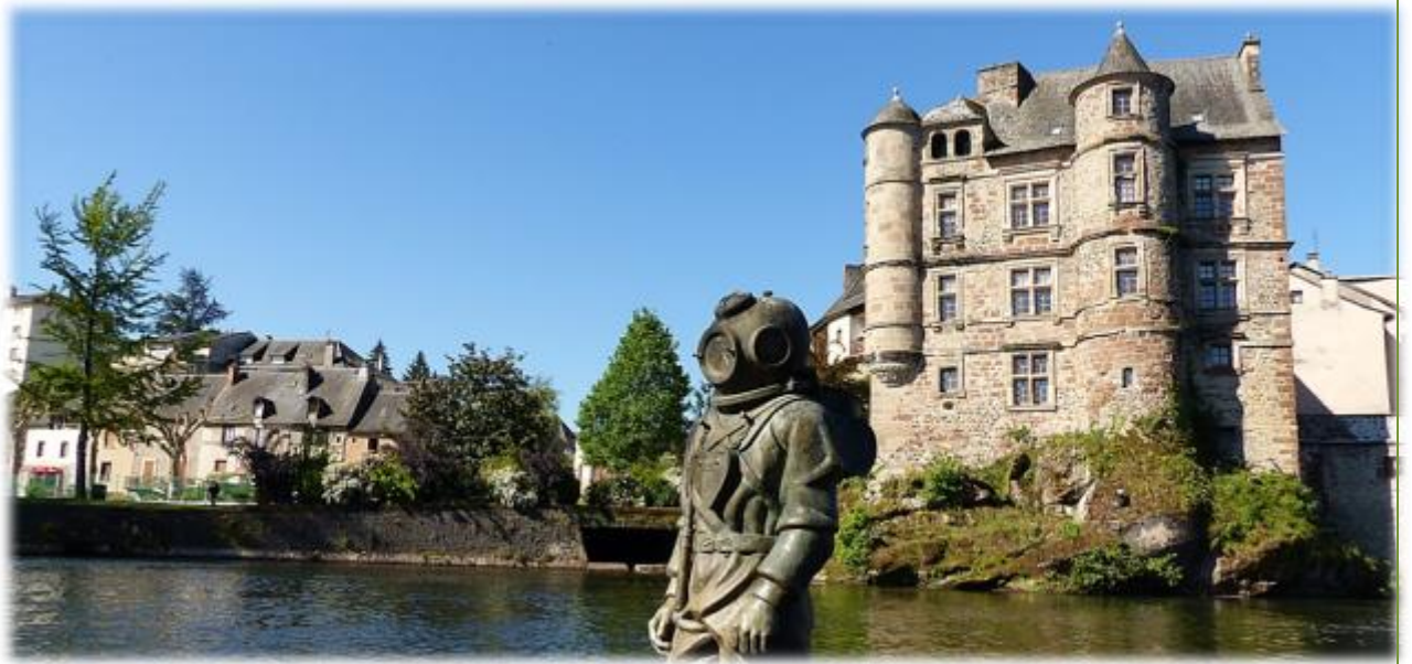
The Lot at Espalion

Le Puy-en-Velay is better for those wishing to travel onto Lyon.