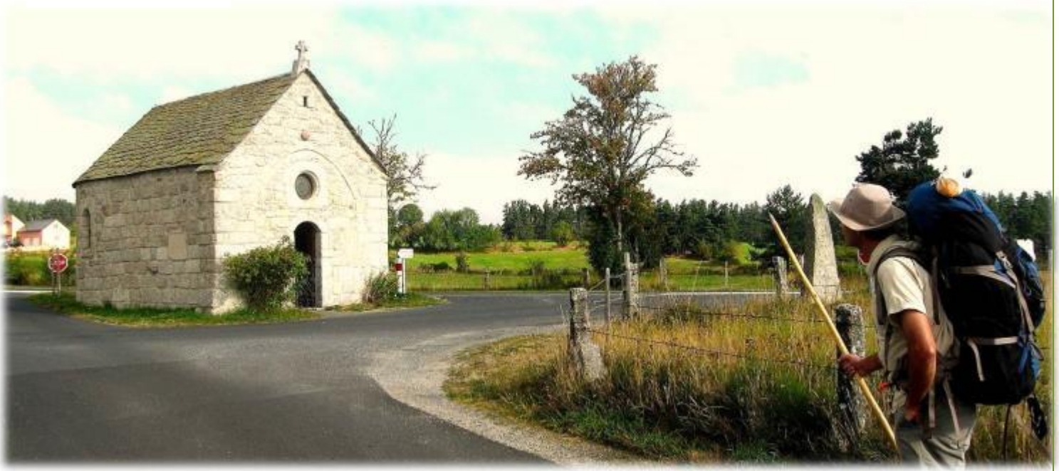
La chapelle de la Bastide

There you have the essential ingredients of our Taste of Camino Francês tour: an opportunity to enjoy the best of what the Way of St James has to offer in two accommodation-led formats to suit your preference. What differentiates this trip from other 'Camino' tours is the emphasis on accommodation excellence. You only get one bite at the cherry, so here's your chance to do it in style. And once bitten, we trust you'll be back for more in the not-too-distant future.