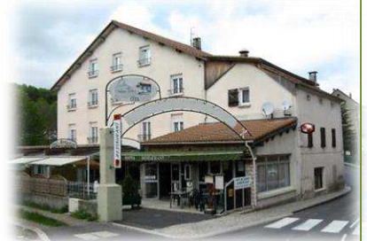
North of Mont Lozere