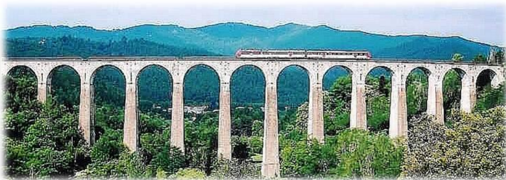
The viaduct near Chamborigaud