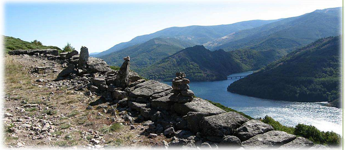
The Regordane Way

“Carefully-selected accommodation based on knowing our partners well.”