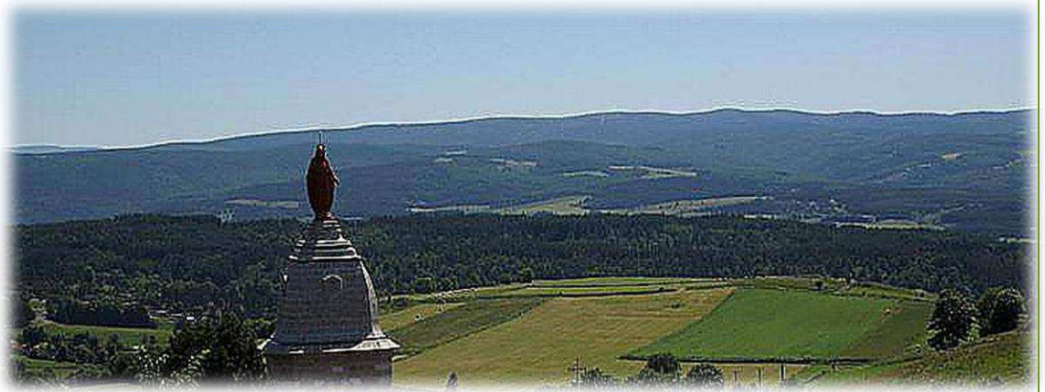
The view from Pradelles