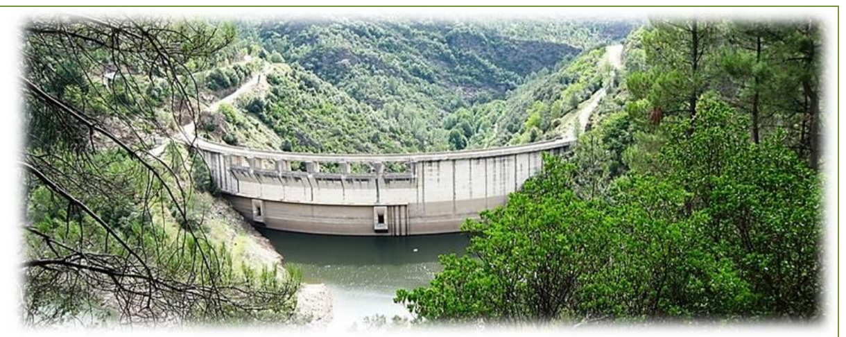
The Senechas Dam