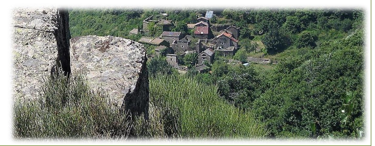
A lost hamlet on Walk One