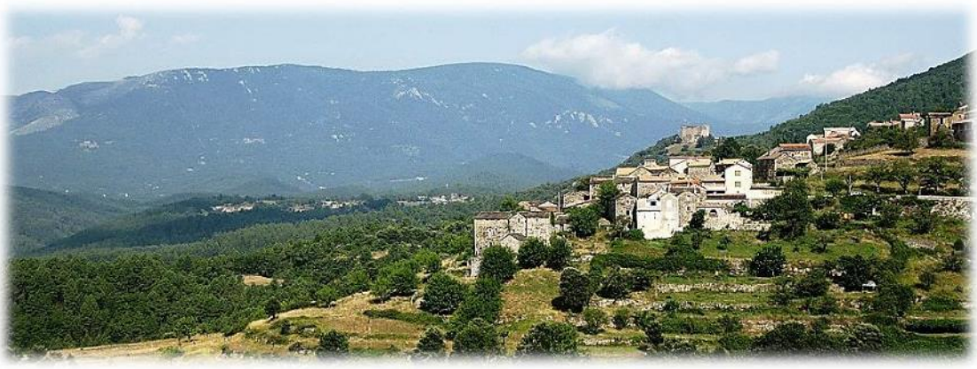
Cheylard castle and the Mont Lozere skyline