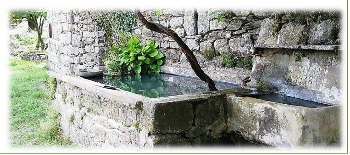
The source of life at Aujaguet