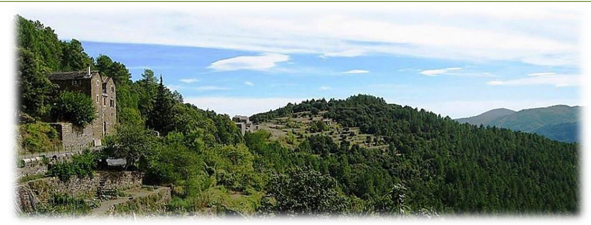
The Cezarenque landscape