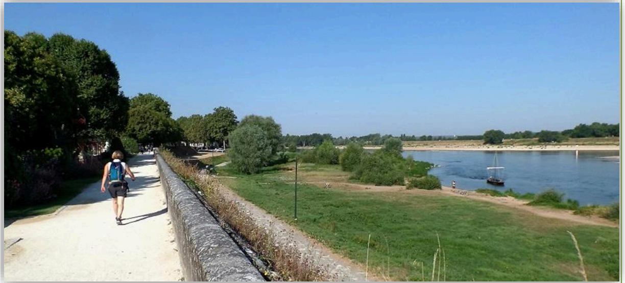
The Loire at Amboise