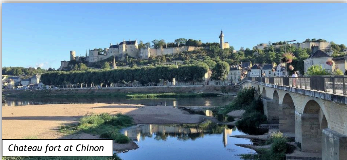
Chateau fort at Chinon

Breakfast followed by check out and onward journey by train. Bonne continuation and we hope to see you next year.