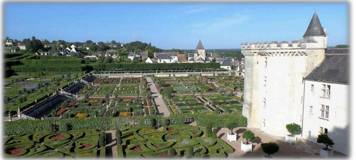
The magnificent chateau and gardens of Villandry

In between, you have the opportunity to... visit numerous chateaux [Renaissance and Medieval - see map below] as well as Europe's largest monastic complex, burial place of none other than Richard the Lion Heart; appreciate the visual splendour of Villandry's renowned and unique 16th century gardens; feast on some of the region's distinctive troglodyte dwellings carved out of the local 'Tuffeau' limestone; hike three other tributaries of La Loire and spend a half-day exploring its largest city, Tours, where the French pronunciation is considered neutral and the wine superlative.