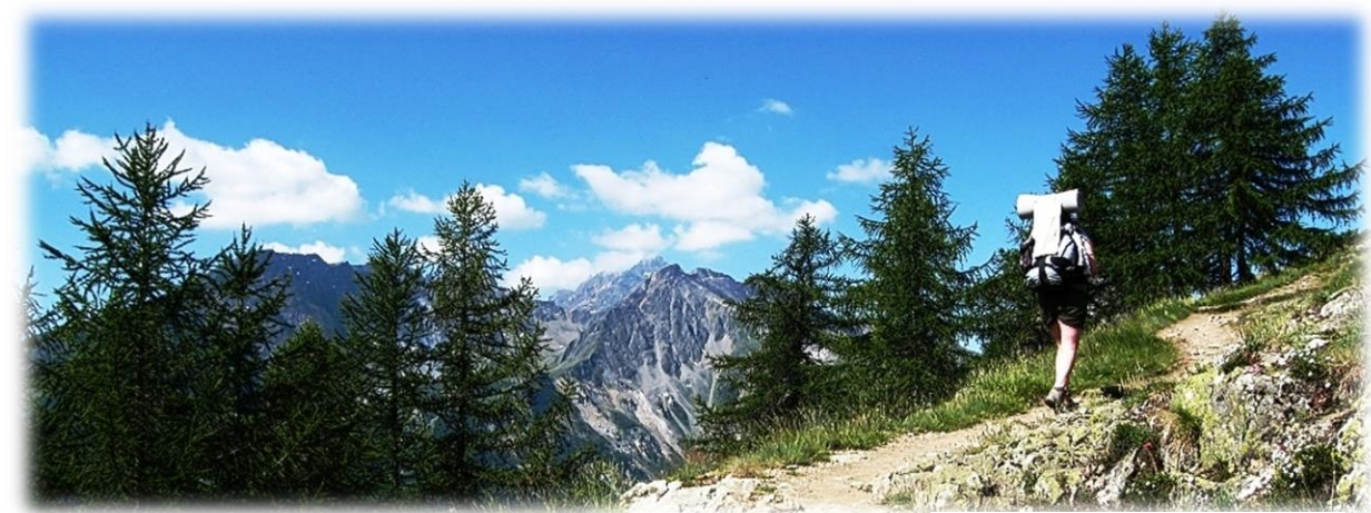
The climb from Courmayeur