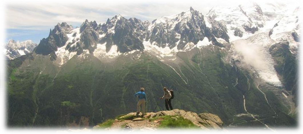
Le Grand Balcon du Sud