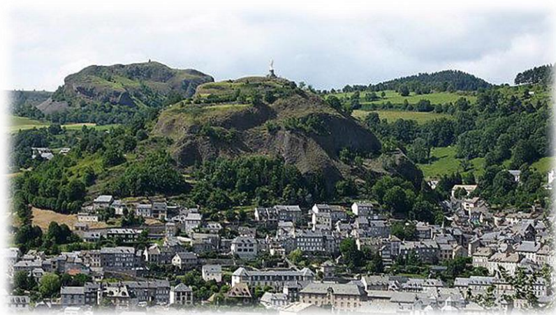
The picturesque Cantalian village of Murat