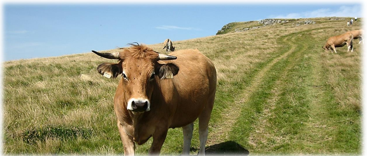
Meet the locals