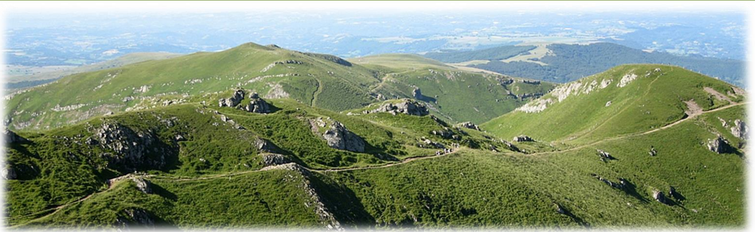
The Roman trail

Best of Walking in Auvergne may not help you with your French, but it should re-fresh your knowledge of physical geography that you felt you would never get the chance to use in practice. In addition, you can feast on some of the region's culinary delights such as alligot, pounti and the renowned Bleu d'Auvergne and Cantal cheeses.