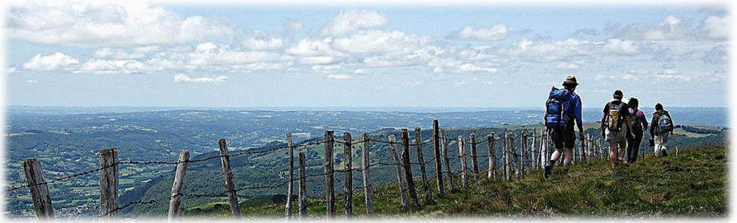
En route from Mandailles