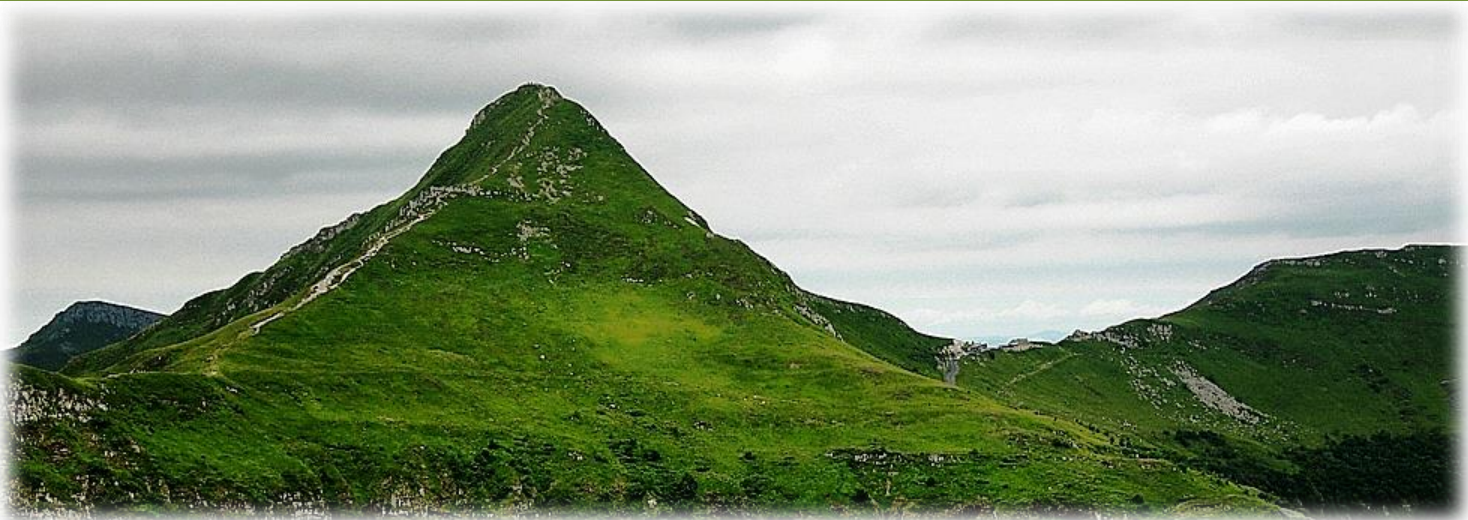
Puy Mary - the sacred pyramid