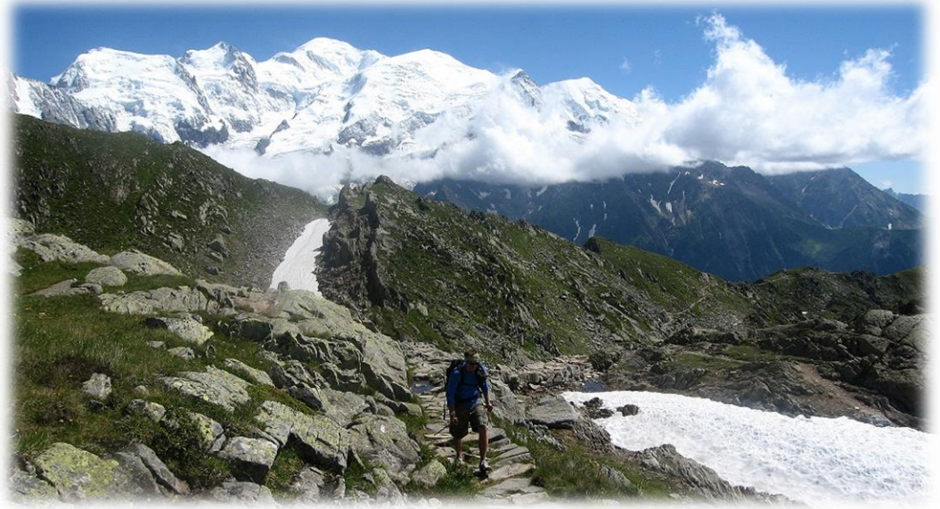
Descent from Brevent