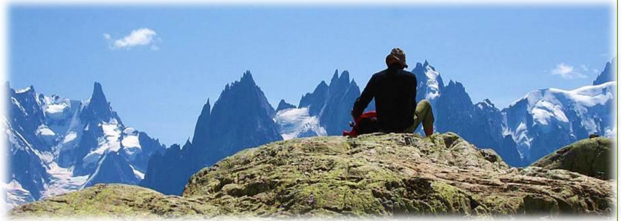
Lunch on Le Balcon