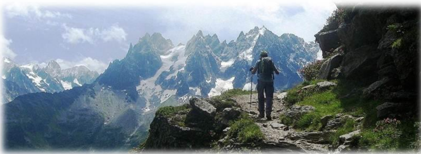
Balcon du Sud