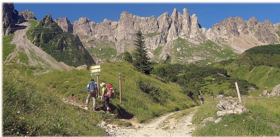
Junction near Miage