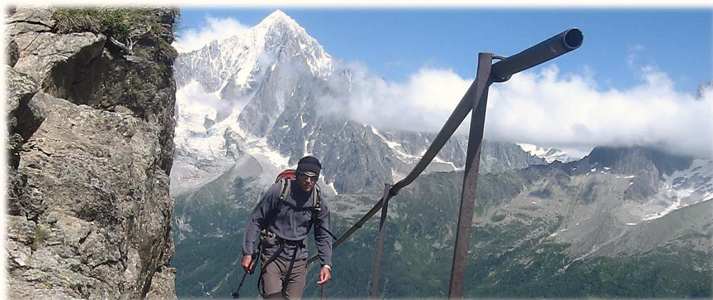
Balcon du Sud with Mont Blanc behind