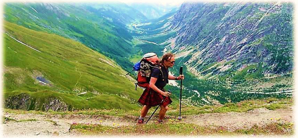
Grand Ferret col - Arnuva to La Fouly