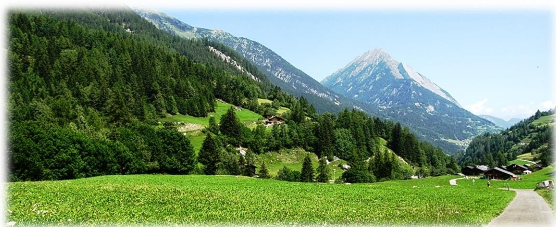
La Fouly to Champex