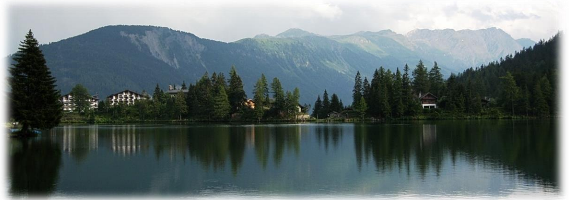
Champex - "little Canada"

So is Alpine Experience for you? Yes it is! A four-night immersion in the Italian-Swiss Alps with limited pain and simply so much to gain.