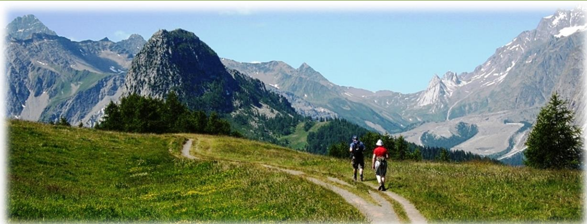
Courmayeur to Arnuva