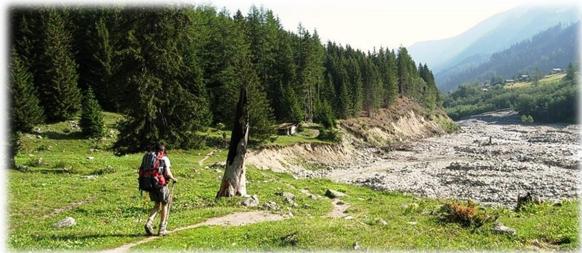
La Fouly to Champex