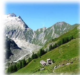
Courmayeur to Arnuva