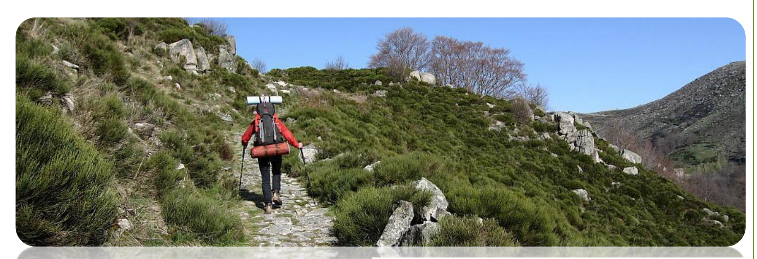
A camper leaving Pont de Montvert - you just carry a day pack!