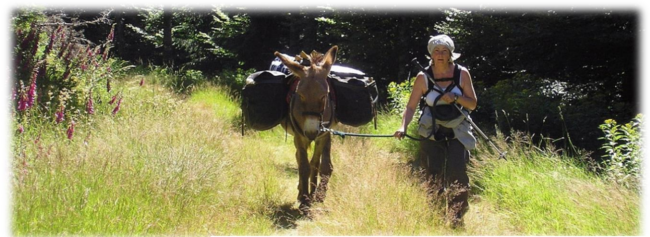
An alternative way of walking the RLS, popular with some of our customers.