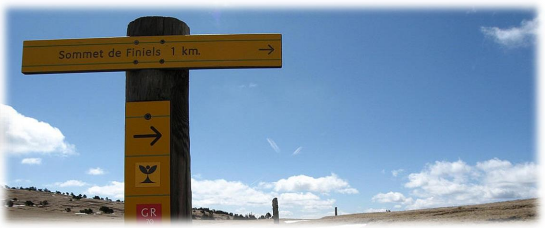
Approaching the heights of Mont Lozere