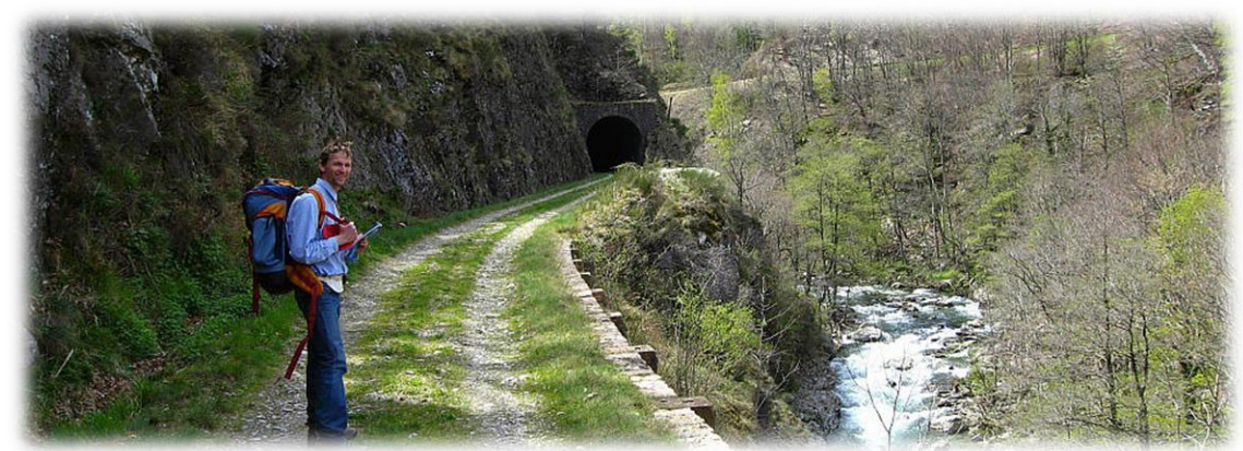
The Mimente Valley trail along the former Florac to St Cecile railway line closed in the 1960s