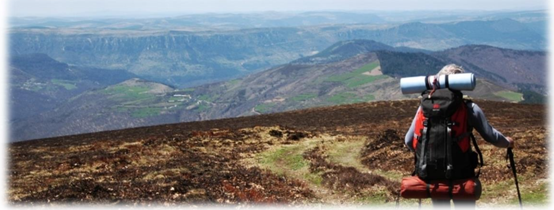
Walking le chemin de crêtes