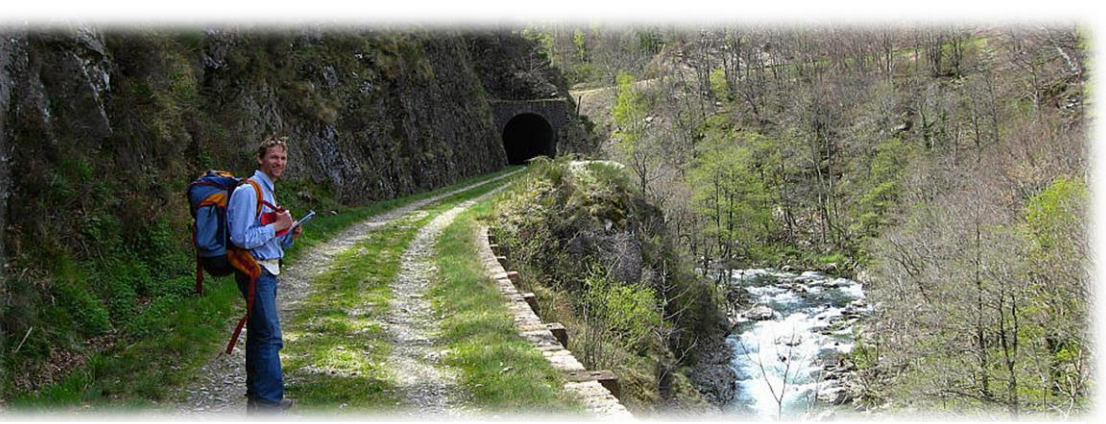
The Mimente Valley trail along the former Florac to St Cecile railway line closed in the 1960s