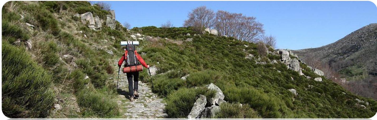
A camper leaving Pont de Montvert - you just carry a day pack!