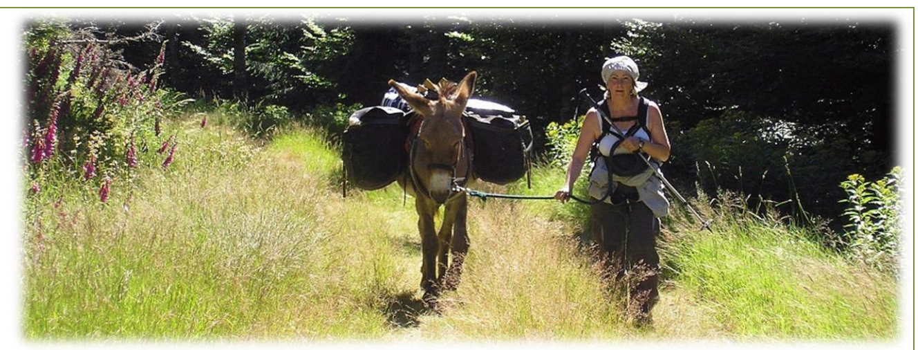
An alternative way of walking the RLS, popular with some of our customers.