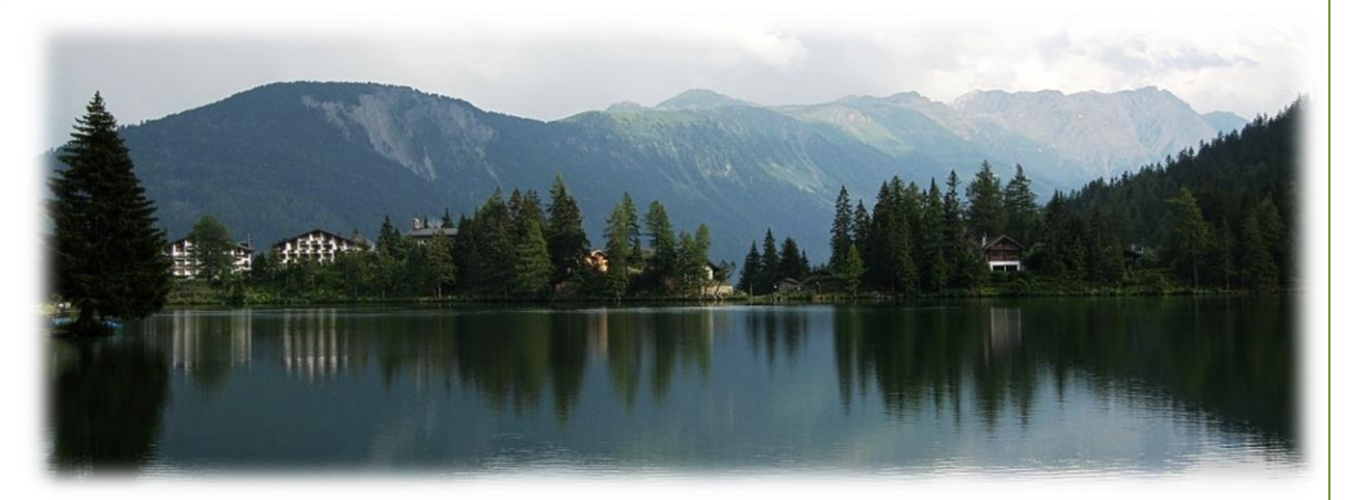
Champex - "little Canada"

Walking tour Mont Blanc [mini-TMB] includes luggage transfers and requires no guide. You will meet many willing companions en route, but our standard-setting walking notes will empower you to hike this extraordinary trail alone or in the company of your own choosing. Snow clears from the higher passes from mid-June and returns at any time after mid- September. Book early, get the best accommodation reserved, consider your travel options and look forward to one of life's rites of passage - irrespective of your age!