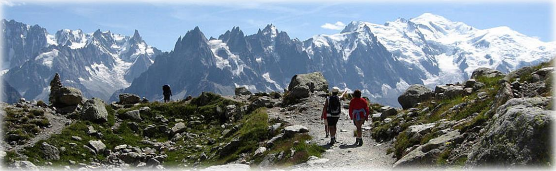
Le Grand Balcon du Sud