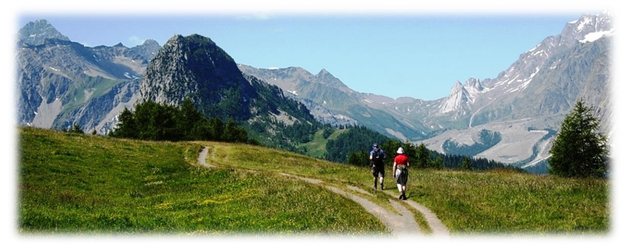
La Fouly to Champex