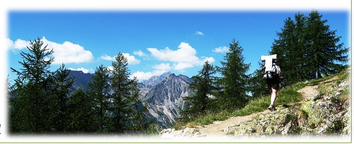
The climb from Courmayeur

• Anglo-French family business that tries harder: join the family!