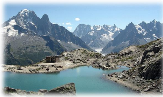
Lunch on the banks of Lac Blanc

Email, phone or Skype us and we will email you everything you need to reserve your tour.