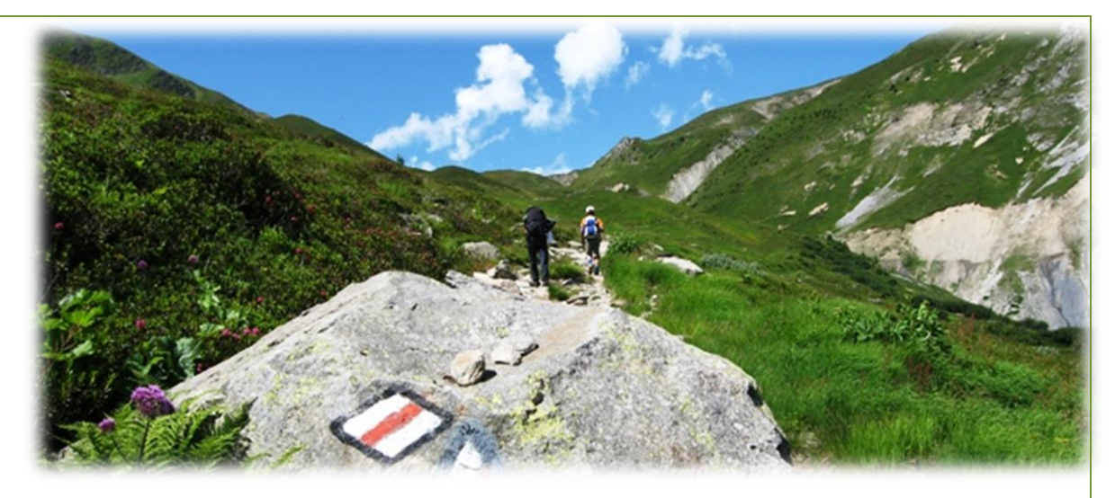
France is just an hour away