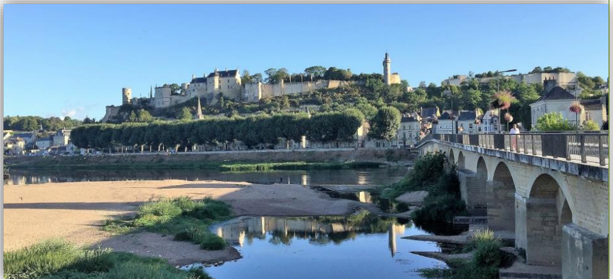
Chateau-fort at Chinon

Breakfast followed by check out and onward journey by train. Bonne continuation and we hope to see you next year.