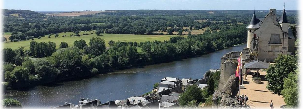
Chateau-fort at Chinon