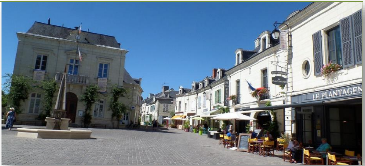
La place du Fontevraud