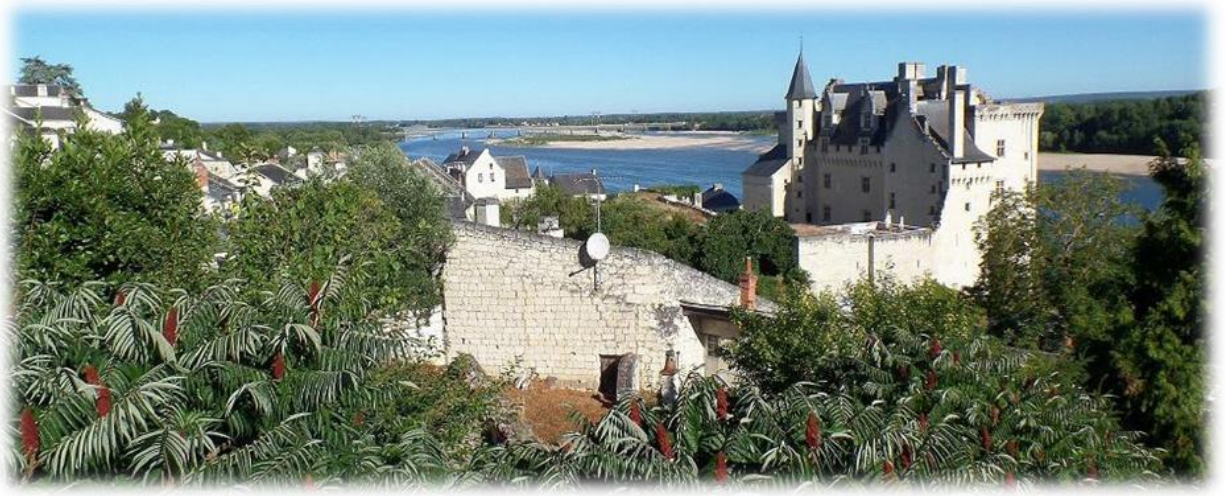
Chateau de Montsoreau