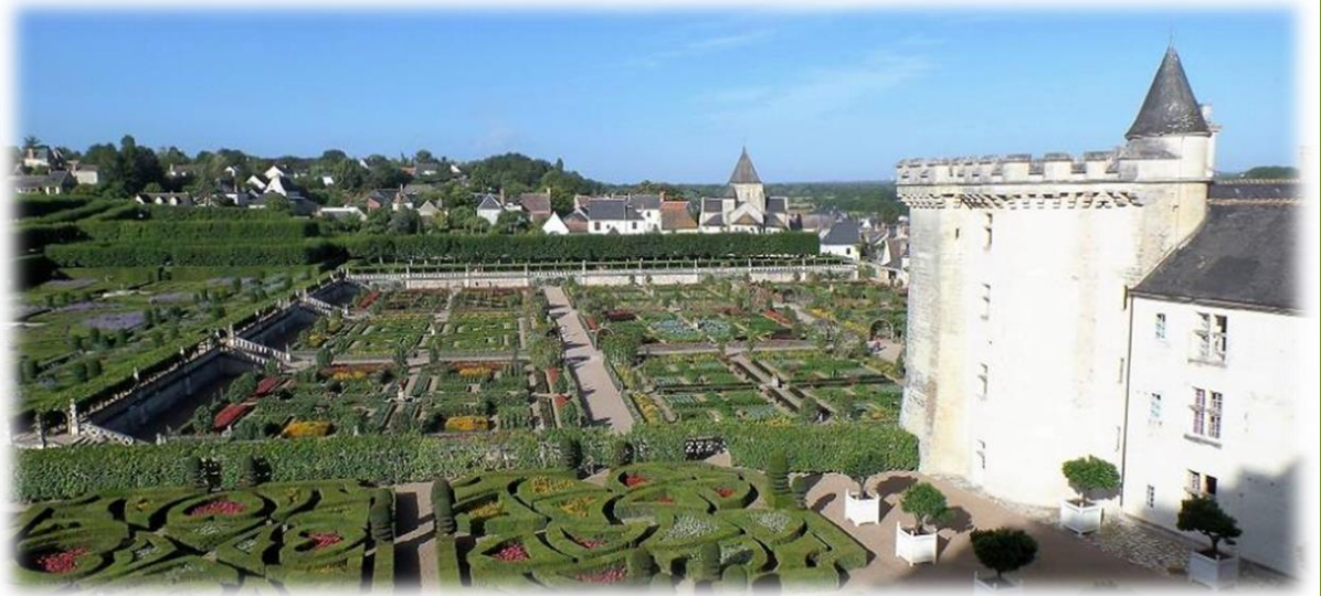
The magnificent chateau and gardens of Villandry

From the aptly-named 'Tours', you then stride out along the river to Villandry, with its impressive Renaissance chateau and unique 16th century gardens. Next in line is Azay-le-Rideau, with its picture-postcard village, chateau and gardens. The walk onto Chinon is a sheer delight, as too the Chateau-Fort lying majestically above the right bank of the river Vienne.