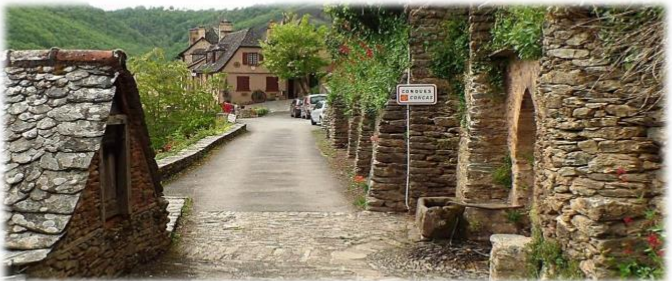
The unassuming gateway to Conques

Breakfast followed by check out. Please enquire about onward transfers to Aumont-Aubrac, Le Puy or Figeac. Bonne continuation and we hope to see you next year.