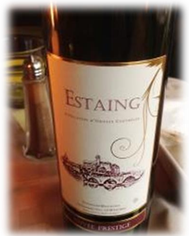
The enchanting Lot Valley