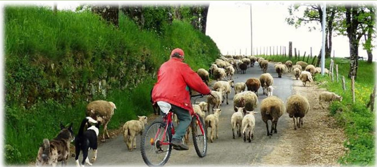
Modern farming methods