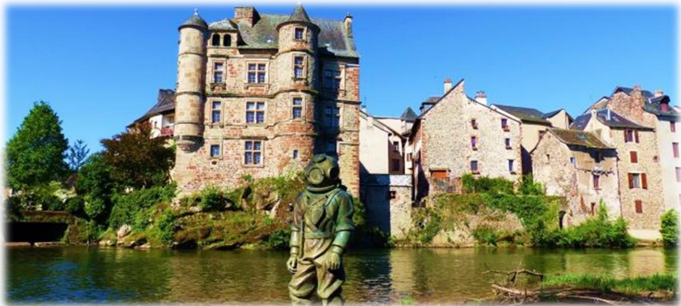
The Lot at Espalion