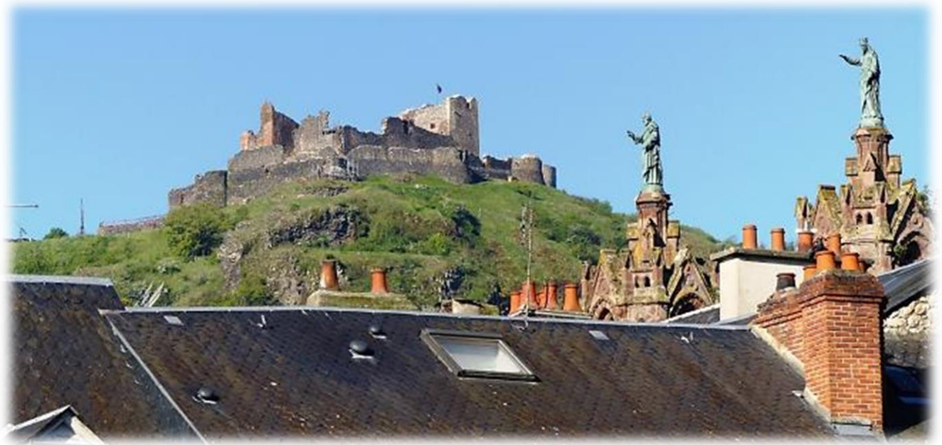
Chateau de Calmont

[10 miles-16 kms, 5 hrs with approx. +420ms -90ms]