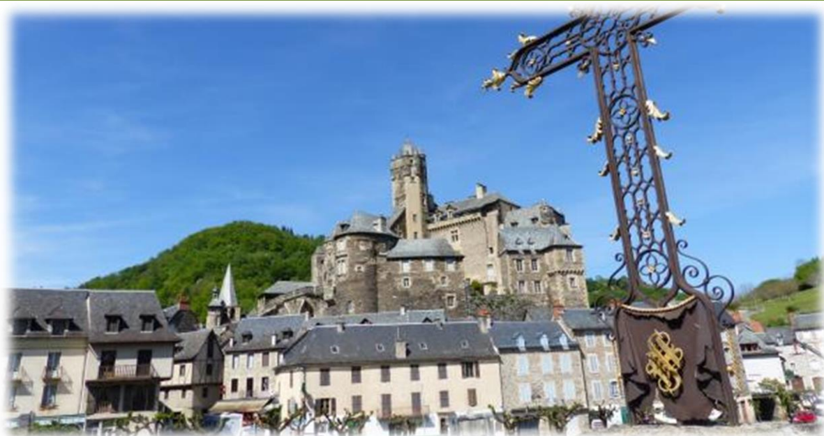
The magnificent chateau d'Estaing

So enjoy the best of the Camino sliced into bite-sized chunks and revel in the experience of a life-time, at a reasonable pace that allows you to get from A to B, chatter with others along the way and still have plenty of time to admire the views and absorb the heritage-rich ambiance.