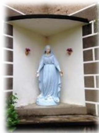
La Chapelle de la Bastide in Margeride

If you seek a fortnight's total immersion in the best of rural France, then look no further than the best section of the Le Puy Route with complementary accommodation.