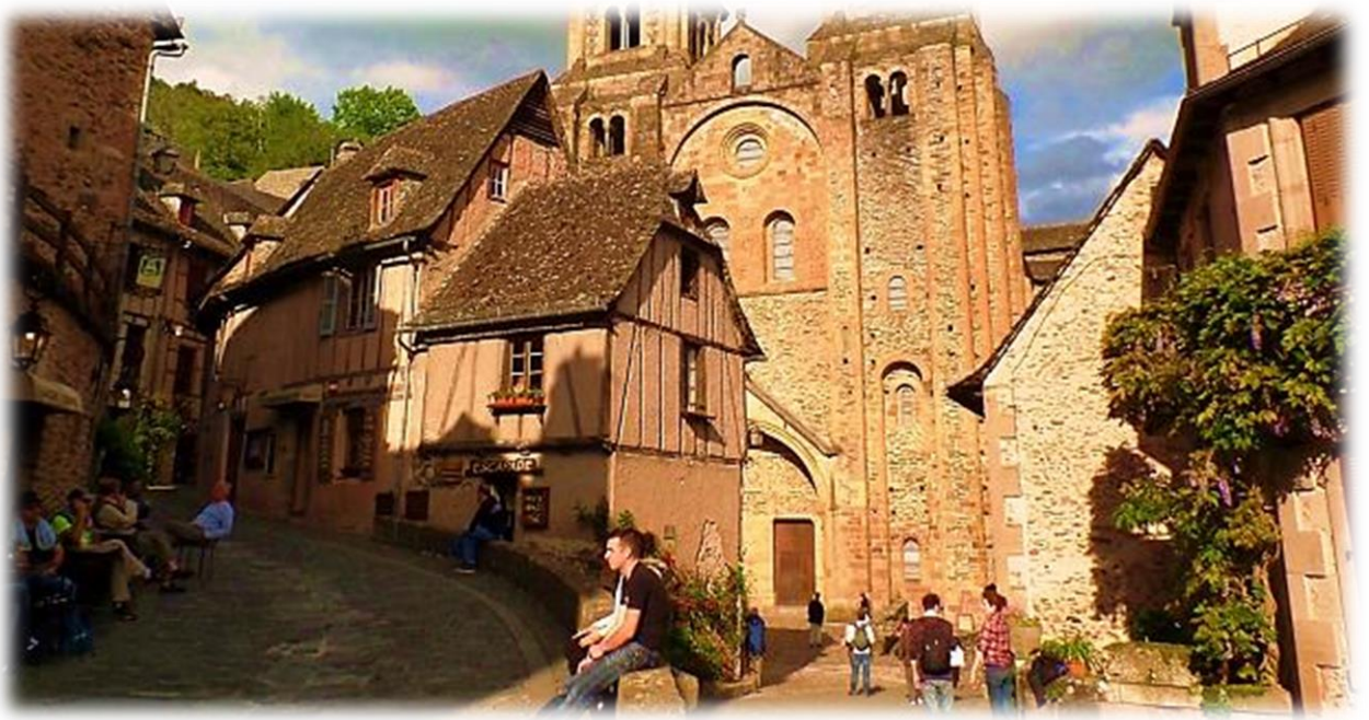
The Abbey at Conques