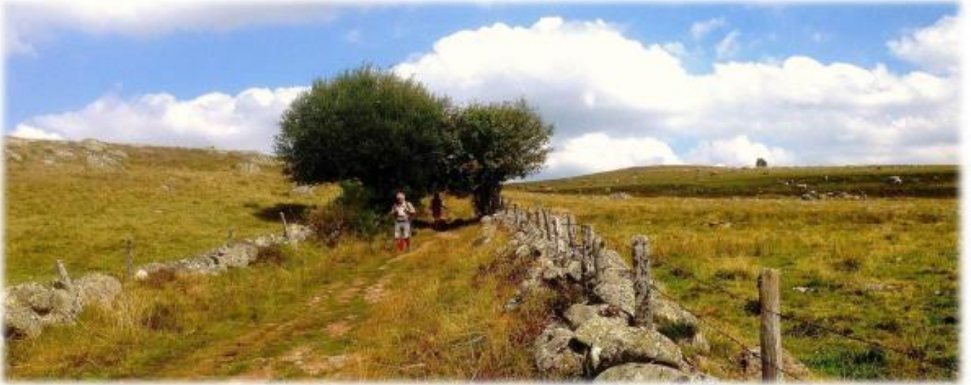
The Aubrac Plateau