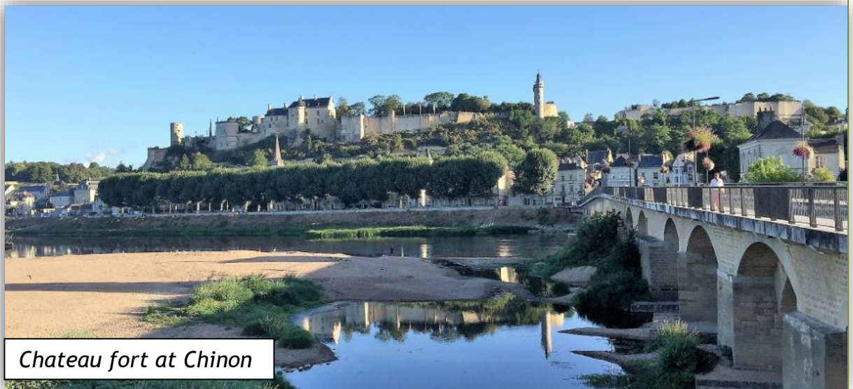
Chateau fort at Chinon

Breakfast followed by check out and onward journey by train. Bonne continuation and we hope to see you next year.