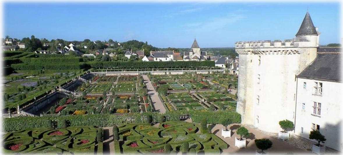
The magnificent chateau and gardens of Villandry

In between, you have the opportunity to... visit numerous chateaux [Renaissance and Medieval - see map below] as well as Europe's largest monastic complex, burial place of none other than Richard the Lion Heart; appreciate the visual splendour of Villandry's renowned and unique 16th century gardens; feast on some of the region's distinctive troglodyte dwellings carved out of the local 'Tuffeau' limestone; hike three other tributaries of La Loire and spend a half-day exploring its largest city, Tours, where the French pronunciation is considered neutral and the wine superlative.