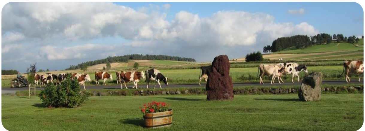
The peaceful scene from Le Bouchet St Nicolas