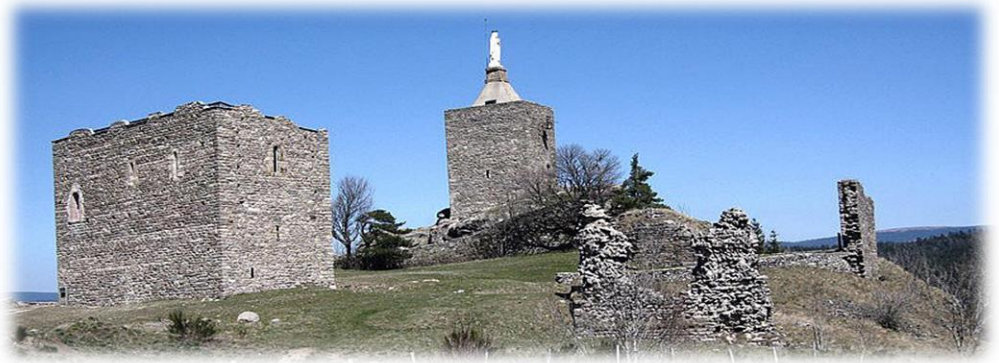
Le Château de Luc