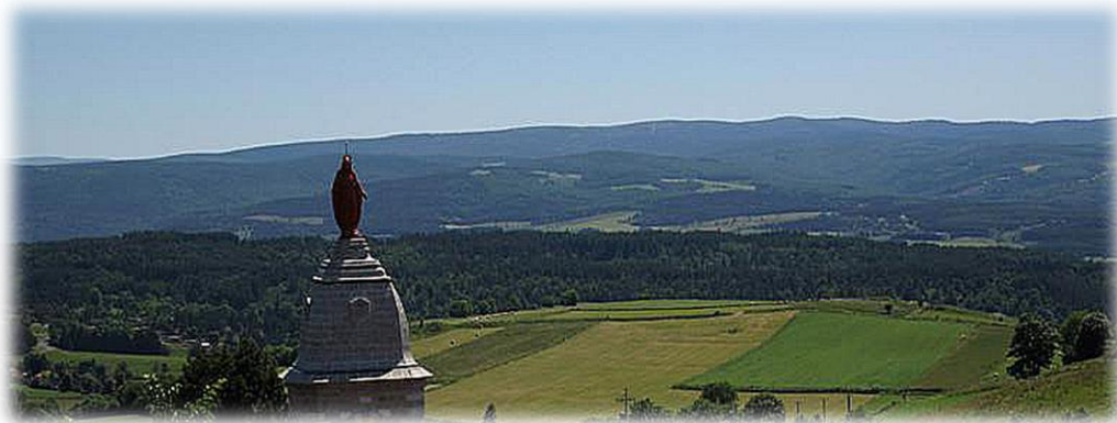
The view from Pradelles