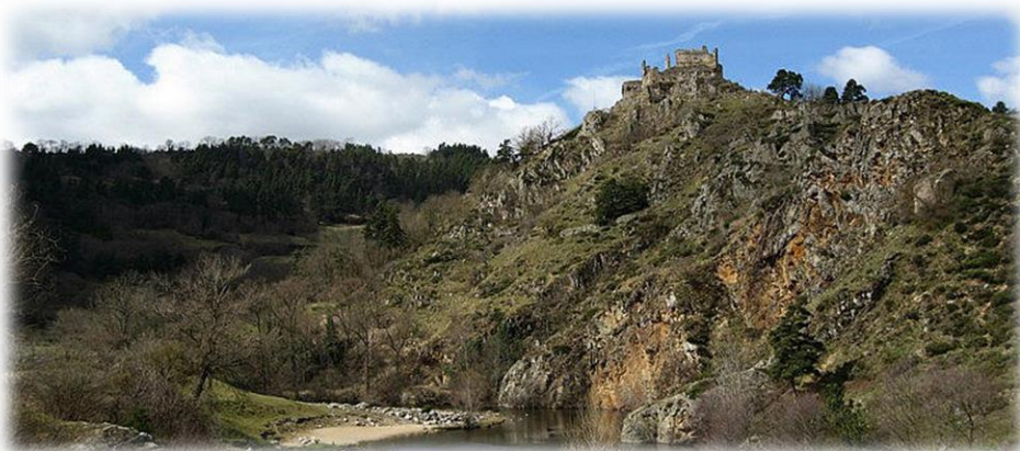
Beaufort castle at Goudet