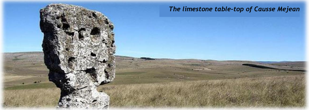
The limestone table-top of Causse Mejean

“Carefully-selected accommodation based on knowing our partners well.”