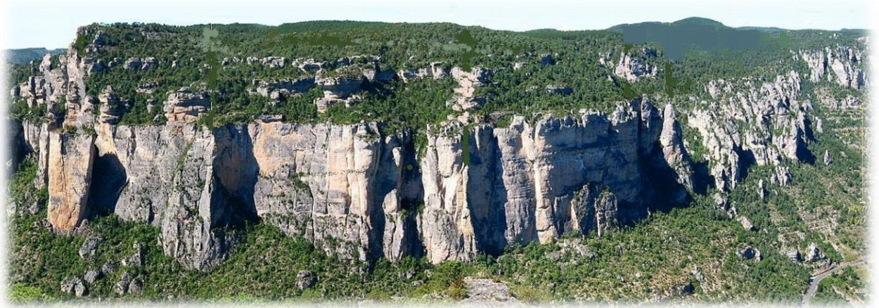
Walk the Jonte Gorge

Tarn Gorge Walks EXTRA offers the ultimate insight into the region that has become known as 'Les Gorges du Tarn.' You walk paths that are as spectacular as the TMB's 'Balcon du Sud' minus the snow; you visit early human settlements and deserted troglodyte ruins that will stretch your imagination exponentially; and whilst the flora is critically acclaimed, befitting of the Parc National des Cévennes, the presence of avifauna, principally raptors, is second to none.