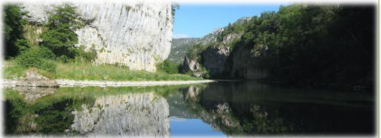
The Gorge bottom

You first three days follow a common trail. The second half allows for options according to your personal preferences and desired level of challenge: stay low and hug the river; or climb high, enjoy the Causses, and return to river-level late afternoon. If you are looking for some extremely flexible and varied walking in France's most remote region, then the Gorges du Tarn is a must.