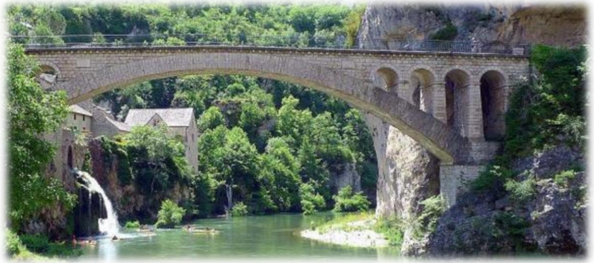
The 'beach' at St Chely du Tarn