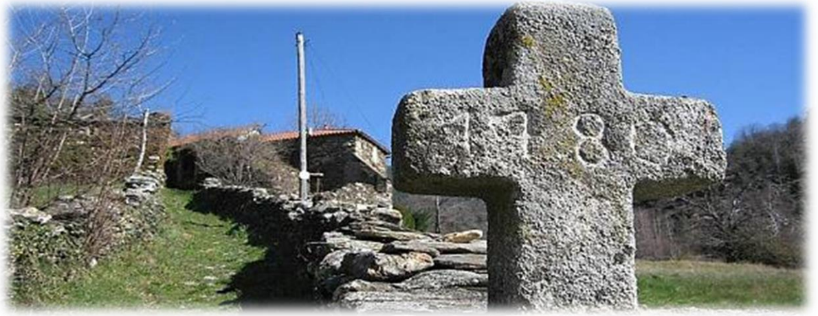
The view from l'Estrade

The Best of the Regordane Way poses a moderate physical challenge and is there to be enjoyed from April to October thanks to our carefully-selected and welcoming mix of accommodation bolstered by luggage transfers. Assess and departure is convenient, either from Nîmes via Alès, or Paris via Clermont-Ferrand, in both cases by the impressive tracks of the Cevenol mountain railway line on which you get to ride back for your second and final night on the banks of Lake Villefort.