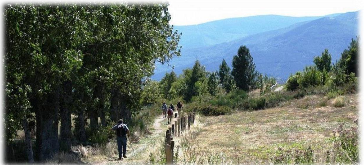
North of Mont Lozere

Note: this 'best of' format showcases the highlights of the trail that has thereafter largely been destroyed over the years as you approach Alès, the Gateway to Cevennes. We have thus decided to omit it from our Regordane tour format. Nonetheless, for those who are determined to walk the trail in its entirety, as per the pilgrims that continue to walk from Le Puy-en-Velay to St Gilles-du-Gard, we do offer options for you to do so upon demand. Please ask us for details or see website for St Giles Way Parts One and Two.