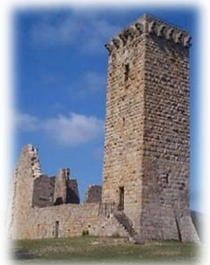
The commanding view from Pradelles