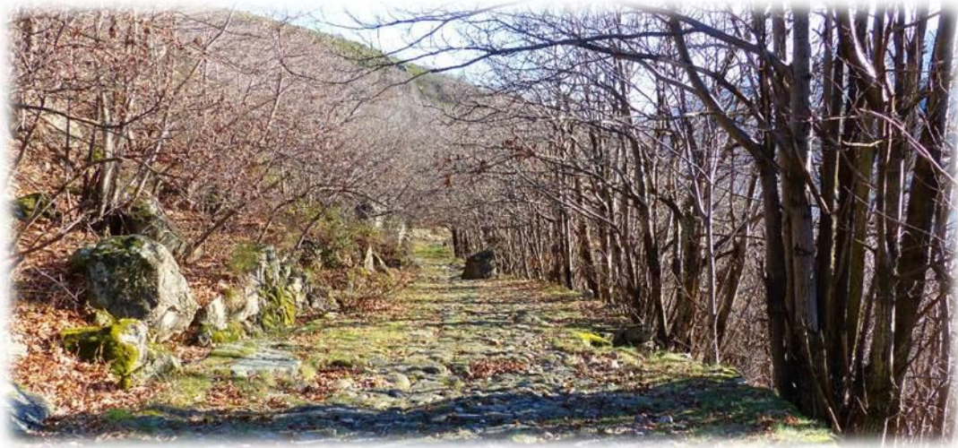
Cobbled causeway near Villefort