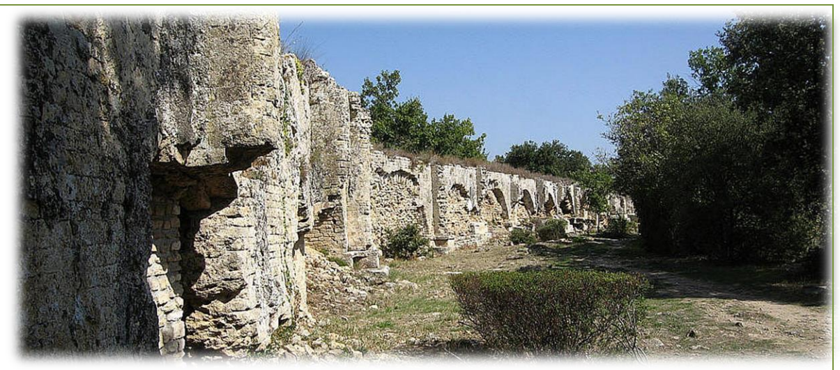
Follow the vestiges of the aquaduct