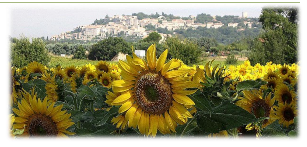
Sunflowers and venerable Vezenobres