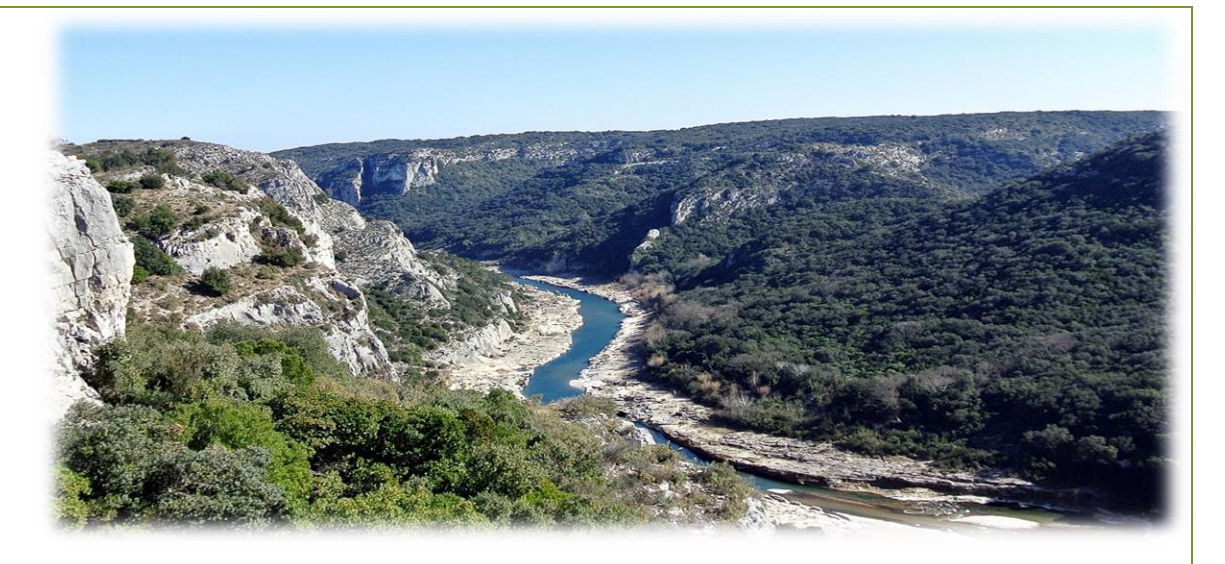
Walk the high plateau and riverside