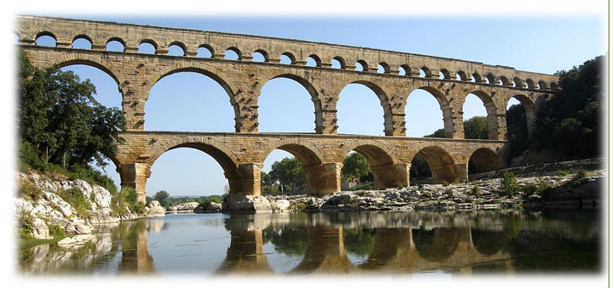
The Roman aqueduct aka Le Pont du Gard

* This grotto is open from 15 March to 1 May and 15 August to 15 November.