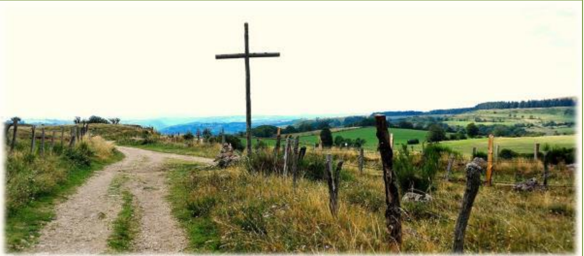
En route to St-Chely