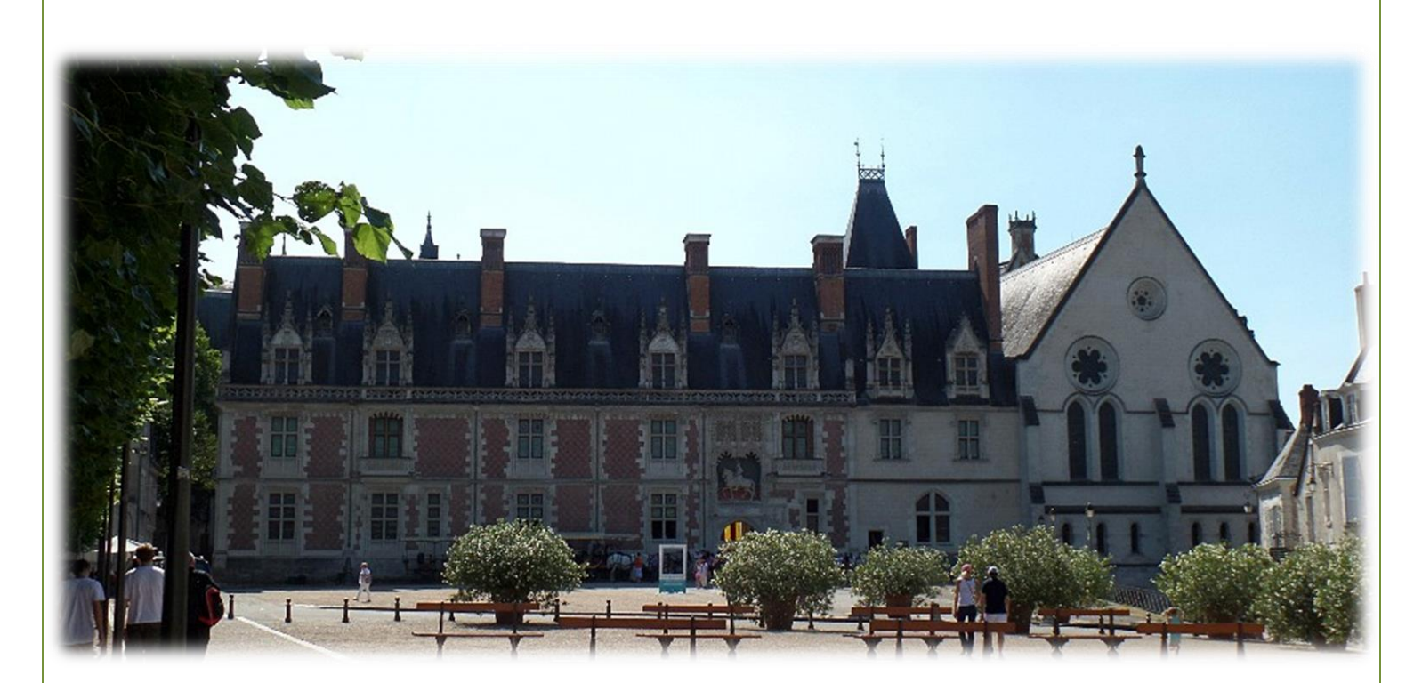
The Chateau de Blois