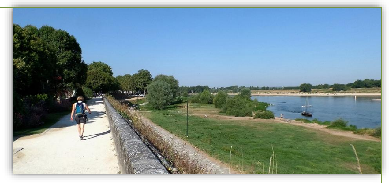
La Loire at Amboise