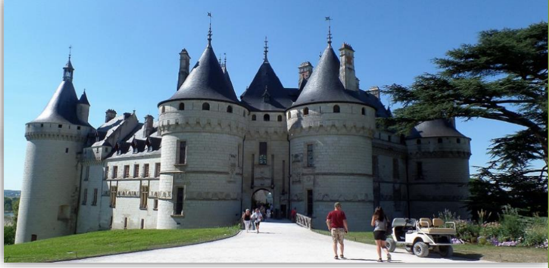
Chateau de Chaumont