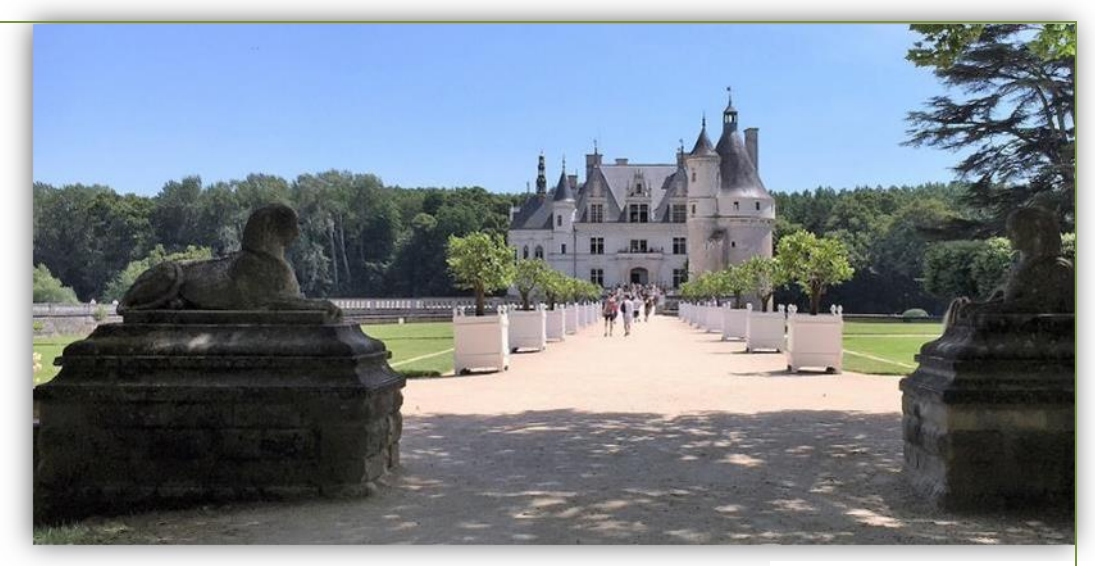
Chateau de Chenonceau

You enjoy half-day walks that enable you to spend plenty of time visiting the castles and other manifestations of cultural heritage in your overnight resting place. Your day-time activities are complemented by the very best of accommodation at every step of the way. That means three, fine 3-star hotels and a fabulous 4-star. We include three evening meals and allow you to choose your own restaurant in the historic centre of Amboise, where options abound.