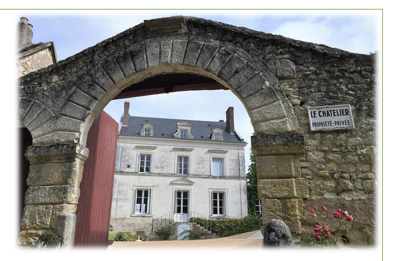
How the French 'other half' live