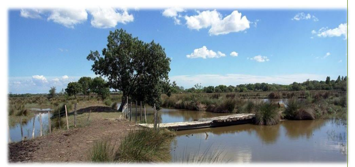
The wetlands; paradise for bird-spotters and home to the charming beaver

* Note: we do not recommend you walk this tour between 1<sup>st</sup> July and 20<sup>th</sup> August due to the intense levels of heat and tourism.