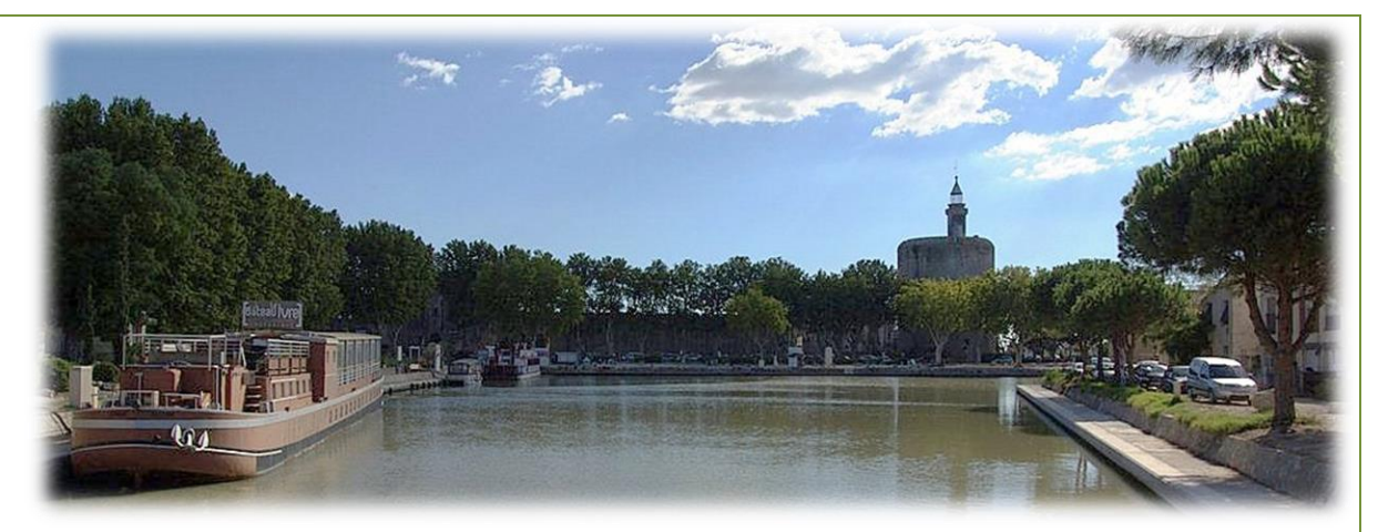
The port of Aigues-Mortes