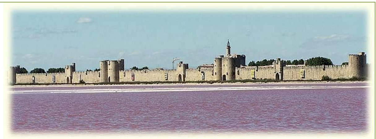
The ancient walled cité of Aigues-Mortes

2. Walking in Camargue immerses you in an area of outstanding European flora and fauna: rare plant species like the glasswort, giant provençal reeds and the summer sand lily - of the 4700 species of flowering plants recorded in France, over 1000 are found in the Camargue; yes, the ubiquitous white horses and black bulls, but also thousands of birds who breed or use it as a resting place on the great north-south migratory route, such as the white egrets (often seen sitting on the backs of horses or bulls) and the emblematic pink (great) Flamingos, who have chosen La Camargue as their only regular nesting ground in Europe.