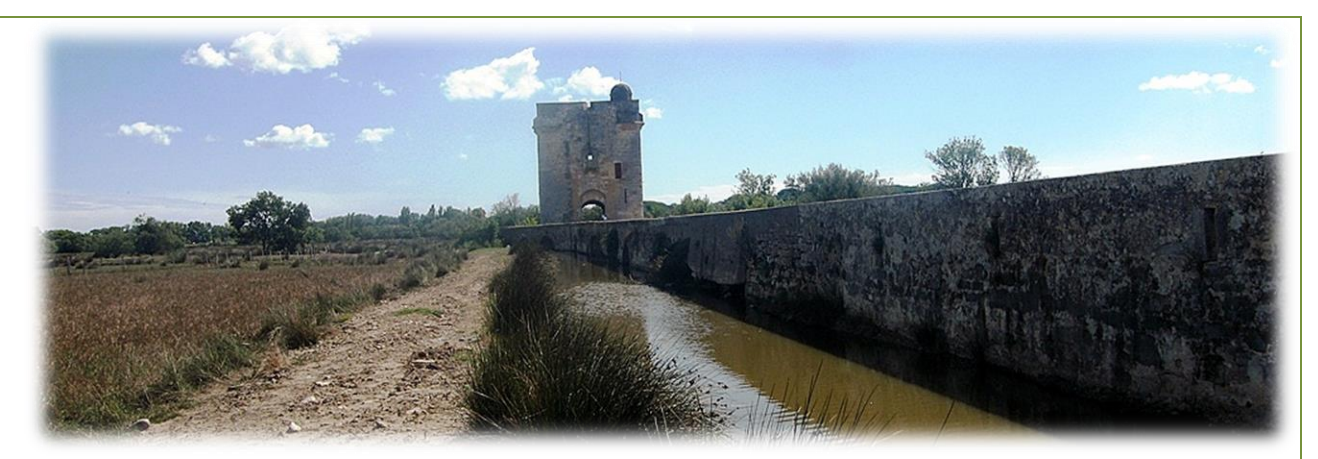
Le Tour Carbonniere - see it as few locals or tourists do