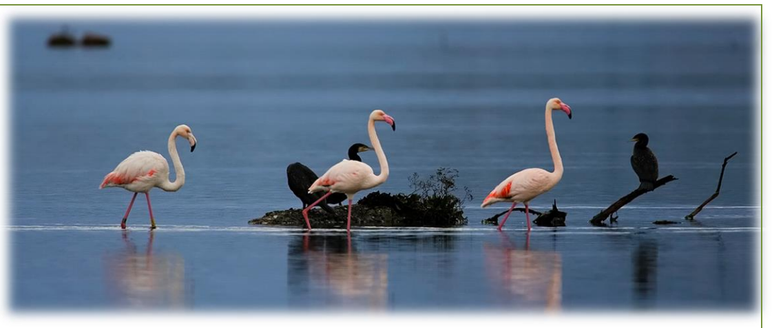
The emblematic Flamant Rose