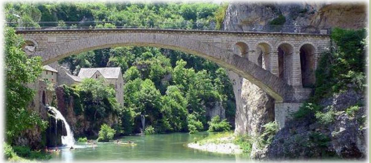
The 'beach' at St Chely du Tarn