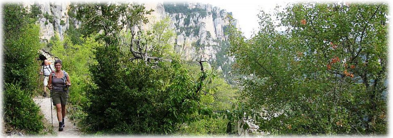
Great views from the ridges