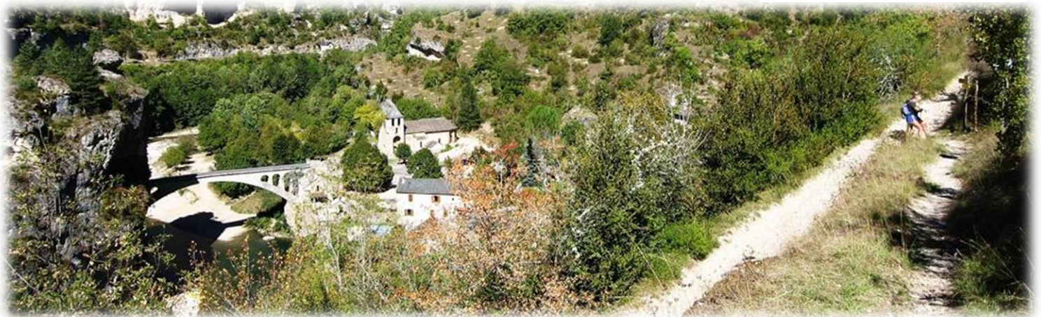
St-Chely from above