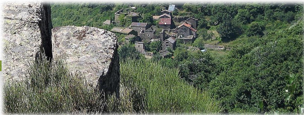
A lost hamlet on Walk One