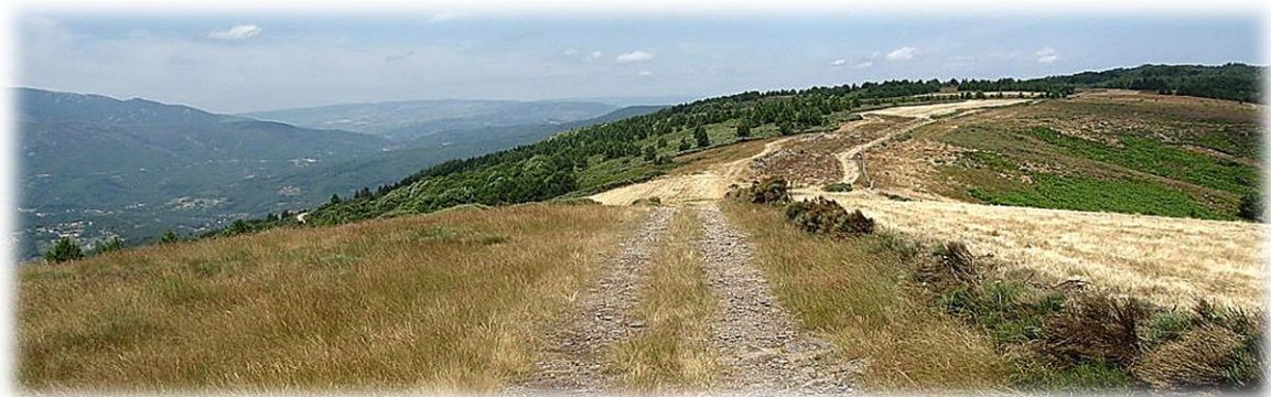
Le Cham Bonnevaux