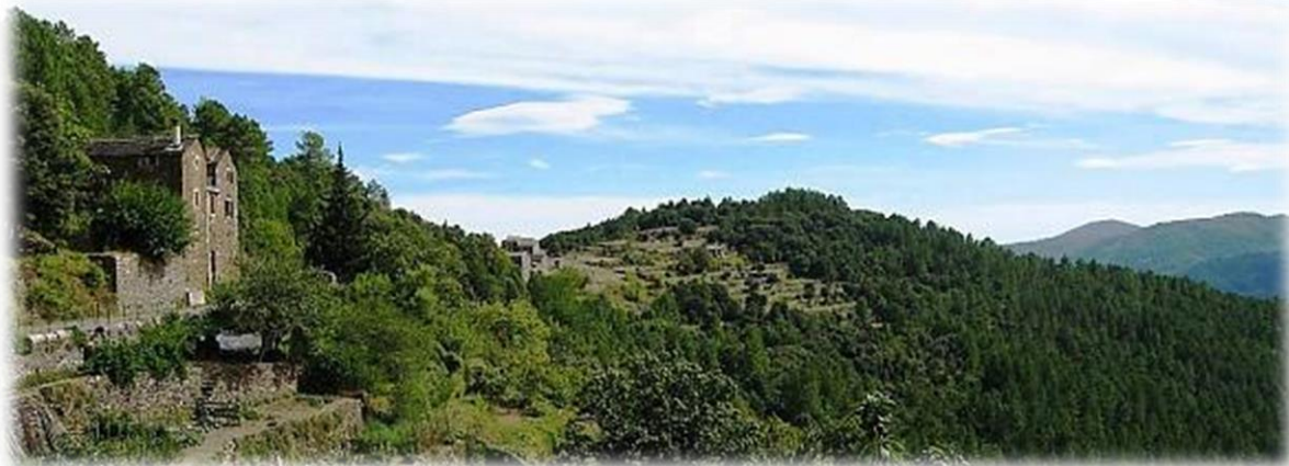
The Cezarenque landscape