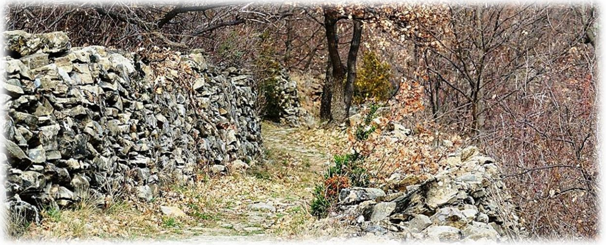
The paved trail to Castillon