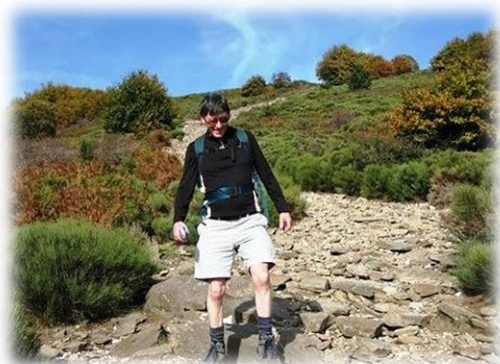
The source of life at Aujaguet