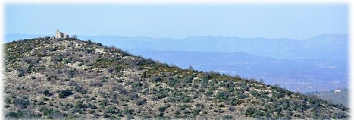
Hillside chapel near Courry