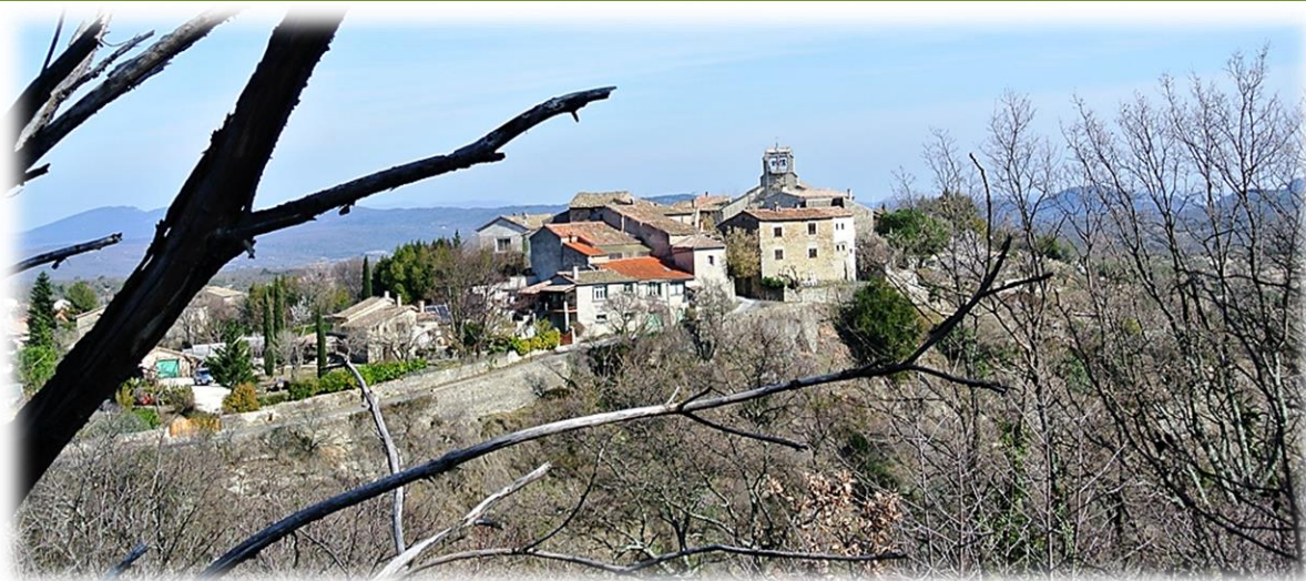
Courry through the trees

“Carefully-selected accommodation based on knowing our partners well.”