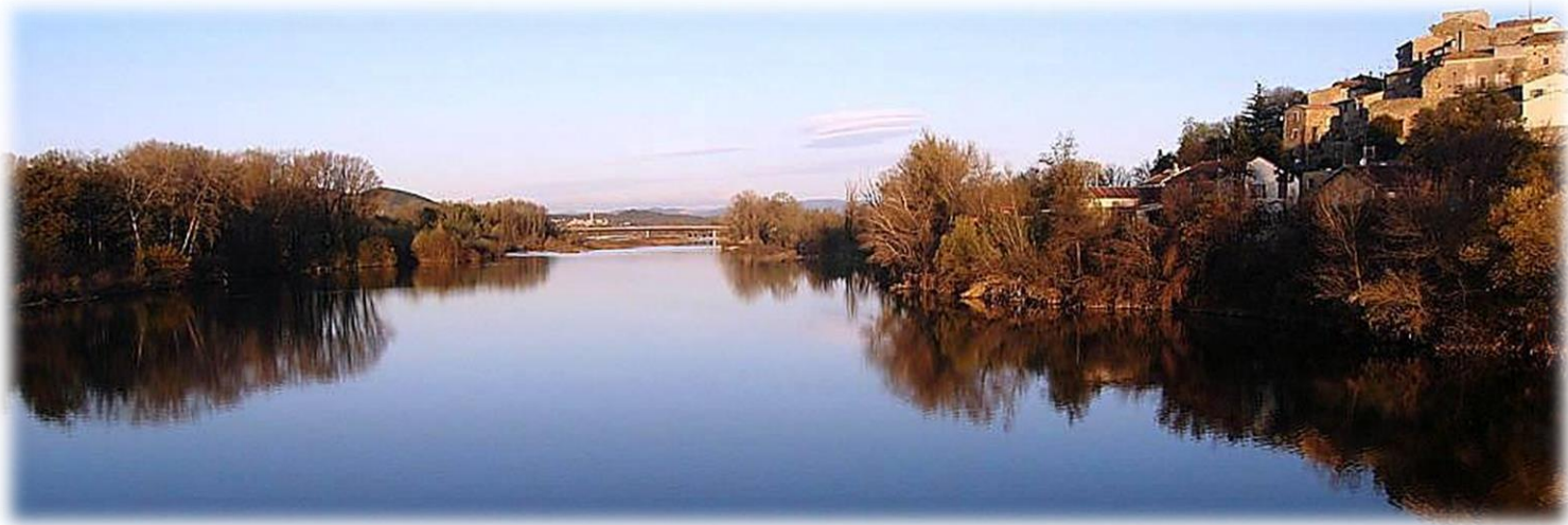
The Gardon, one Autumn morning