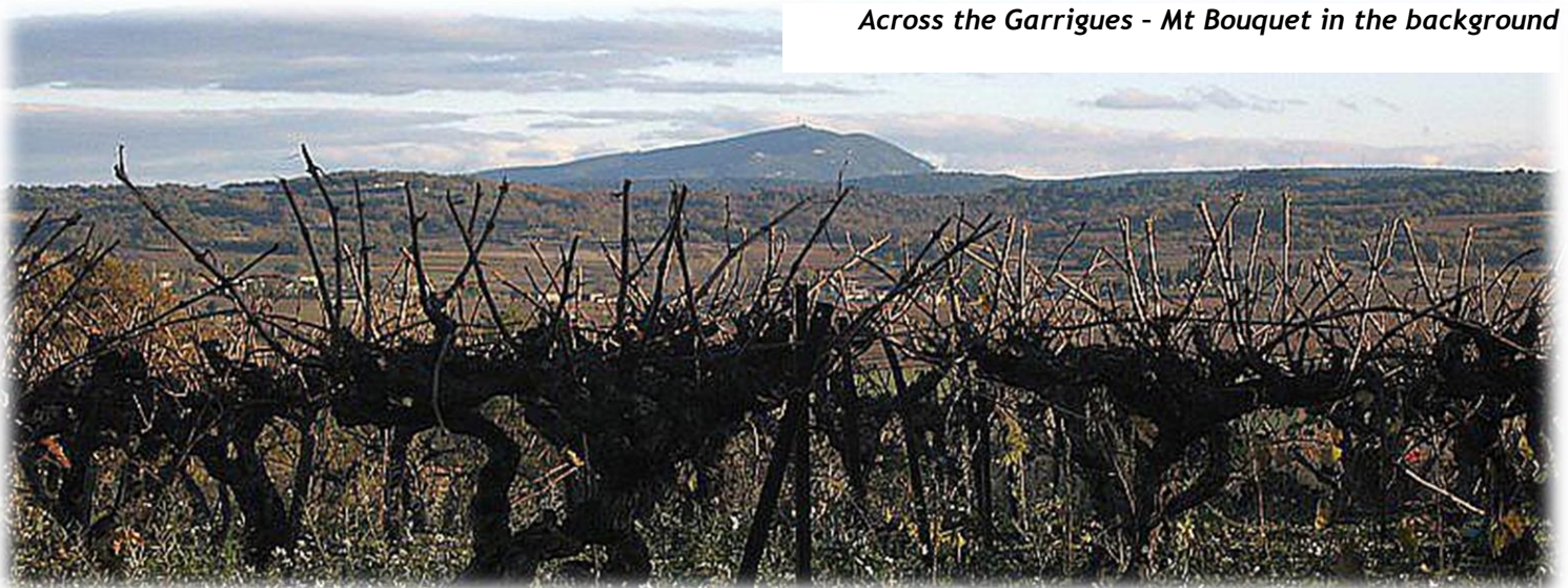
Across the Garrigues - Mt Bouquet in the background