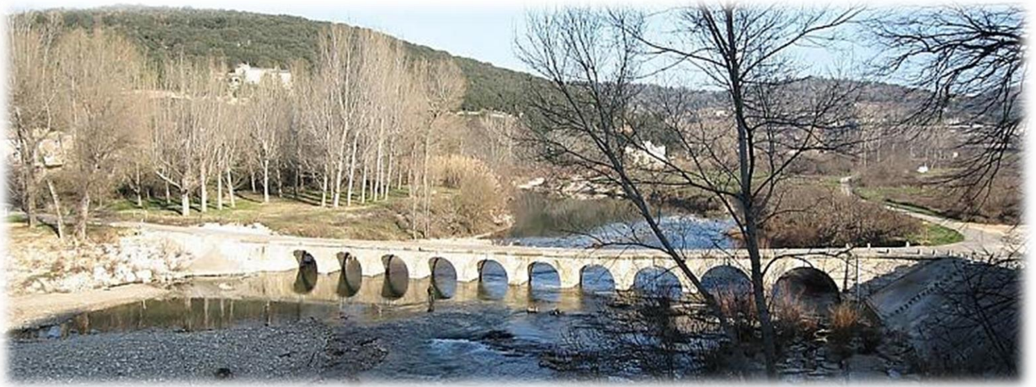
The Cèze at Montclus bridge