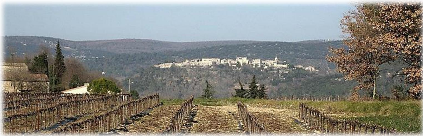
The view over to Cornillon

[9 miles/14 kms in approx. 5 hrs walking, +/-160 ms alt.]