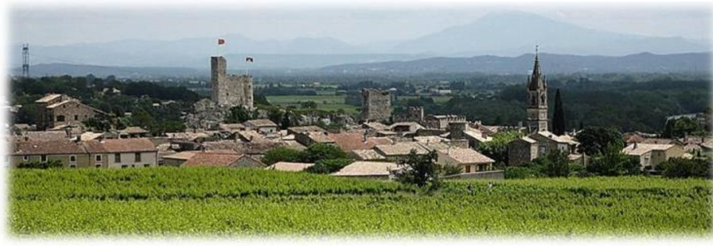
That's Mont Ventoux in the background