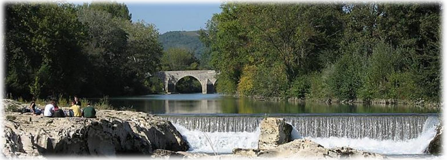
The Sautadet Falls and the Martel Bridge