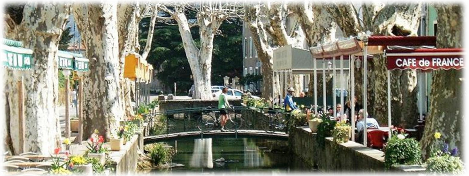
Canal at Goudargues