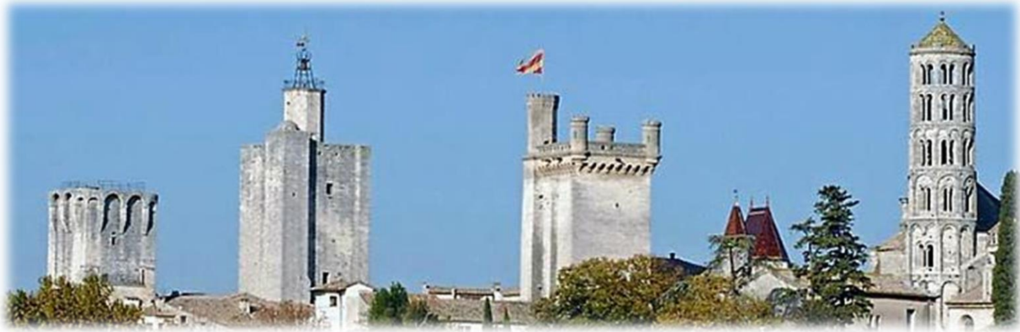
The Uzès skyline