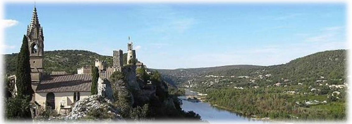
The Ardèche Gorge at Aiguèze