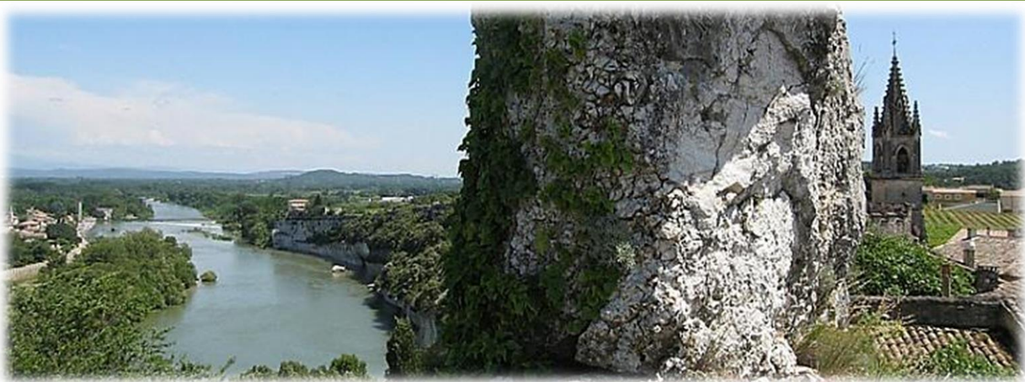
The Ardeche Gorge at Aigueze