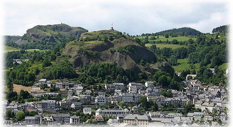
The picturesque Cantalian village of Murat