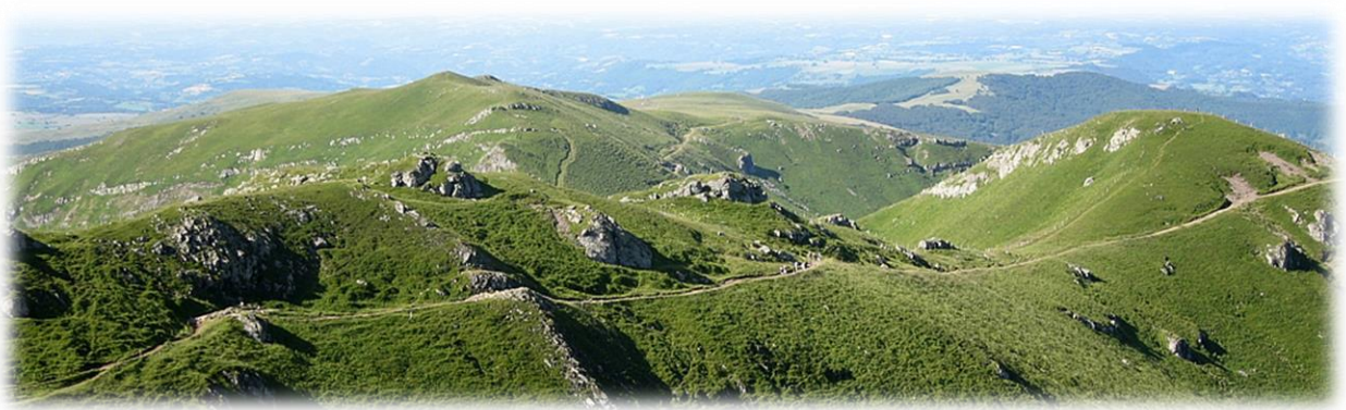
The Roman trail to Thiezac