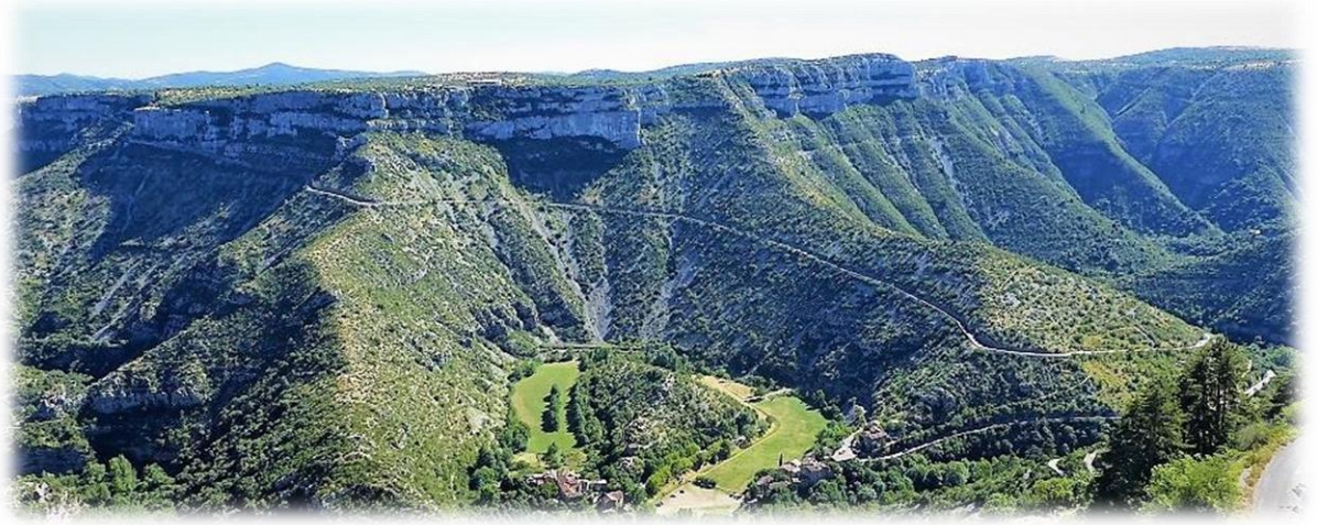
La Cirque de Navacelles

This self-guided walking tour offers a moderate challenge, with a total distance of 115 miles/185 kms, averaging 12 miles or 19 Kilometres per day. The Trail follows a selection of top GRs from the highlands of World Heritage Aubrac in the north (1350 ms altitude) to UNESCO's Saint-Guilhem (105 ms) in the south. En route your hiking trip is punctuated by some of southern France's most picturesque villages, farmsteads and churches; an impressive assortment of stone crosses, menhirs, bridges and hermitages; and complemented by a mix of small-scale characterful and comfortable accommodations. Due to bottlenecks, the maximum group size is eight.