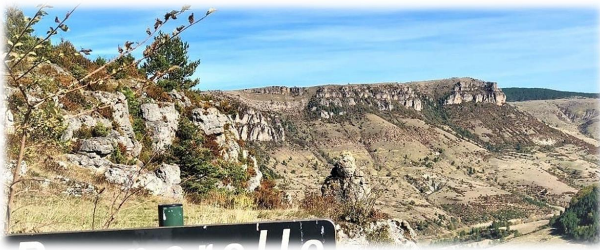
The view from Pauperelle