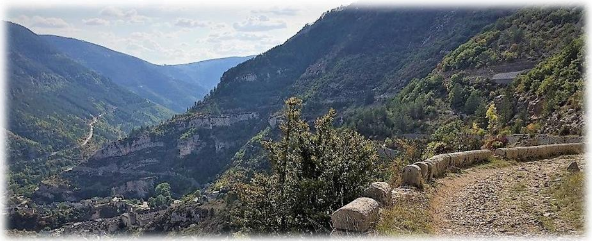
Descent to Ste-Enimie

[Approx. 14 miles/23 kms, +540 ms/-555 ms, 7 hrs walking]